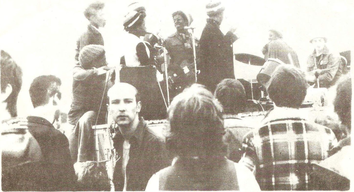
Playing for the West Indian Community Association