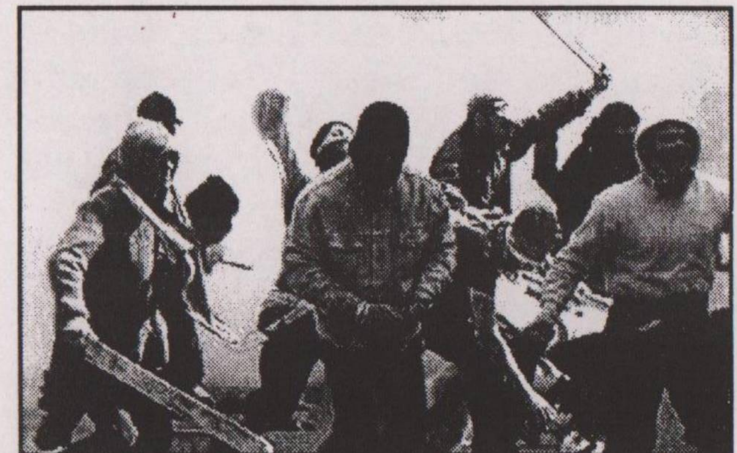
Anarchists on the frontline in Naples. Report inside (see 'Nessun Dorma' article)