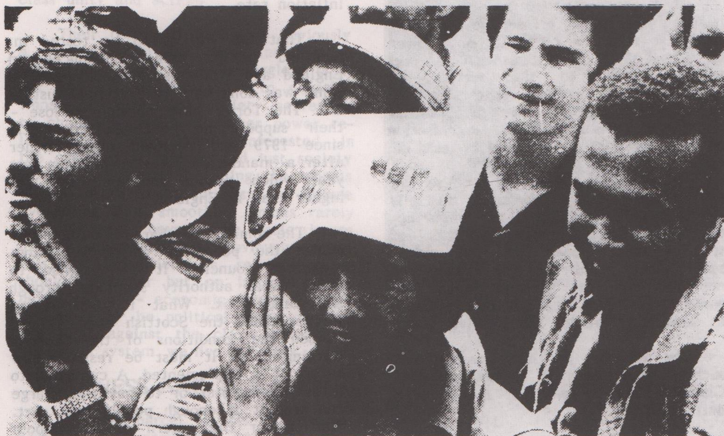
Striking Brazilian Workers

Send donations to: Direct Action, Box DA, Raven, 75 Piccadilly, Manchester, M1 2BU.