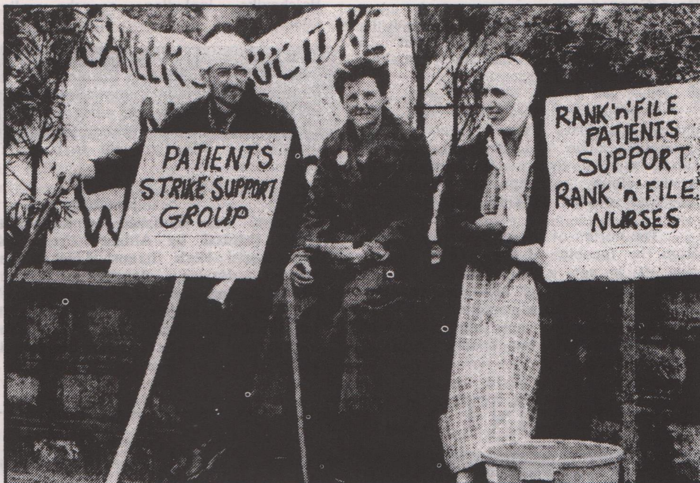
Pickets (former patients) supporting the nurses strike outside the Epworth Hospital

In Western Australia the Robe River Iron mining company locked out its workers over a number of "restrictive work practices" (actually a number of agreements covering a range of health, safety and other conditions that make working more bearable in the harsh north-west of the state). Despite threats from the State Conciliation Commission, workers were locked out for over 2 weeks and were forced in the end to agree to negotiate on some work practices.