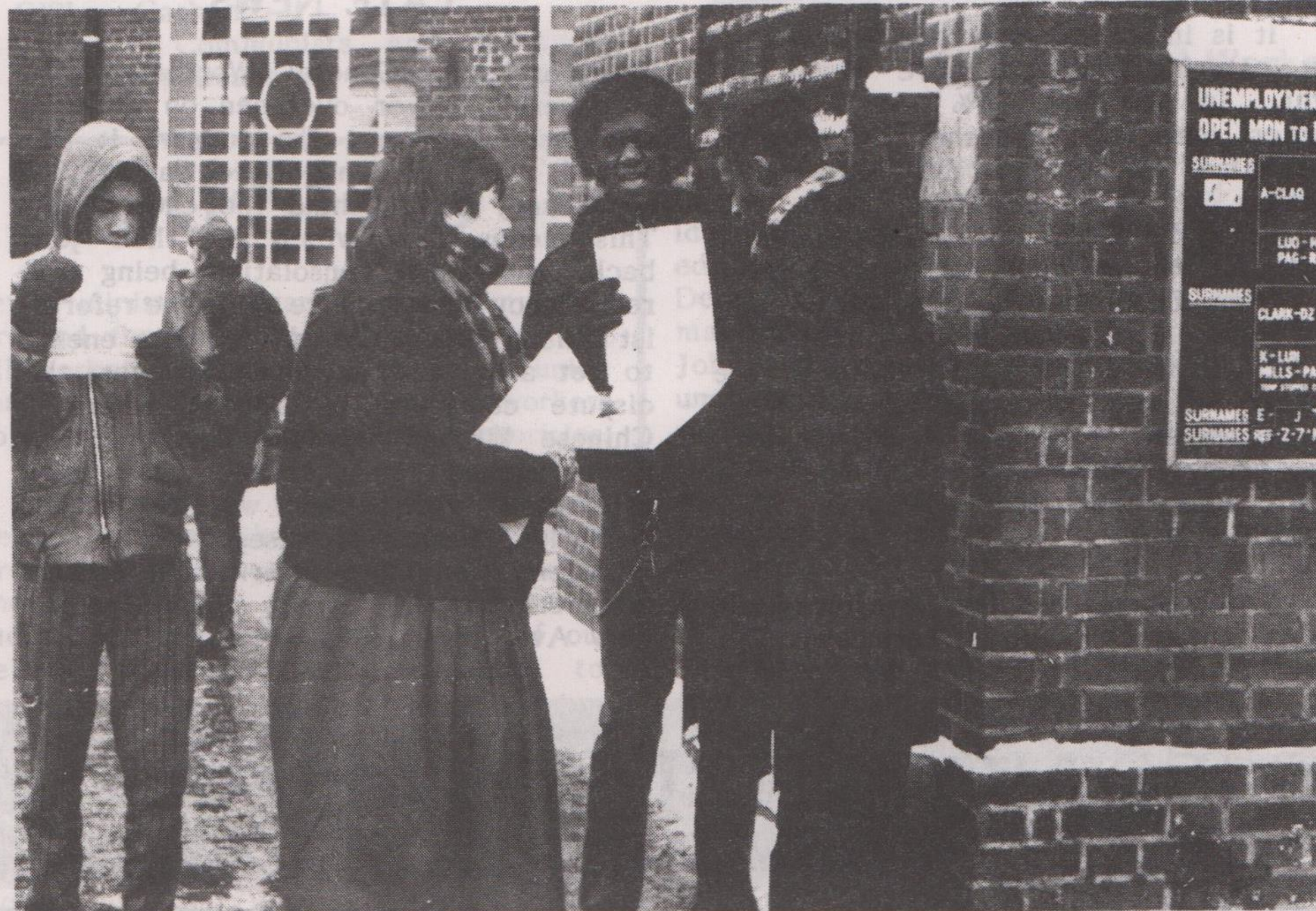
Pickets and claimants discuss the issues