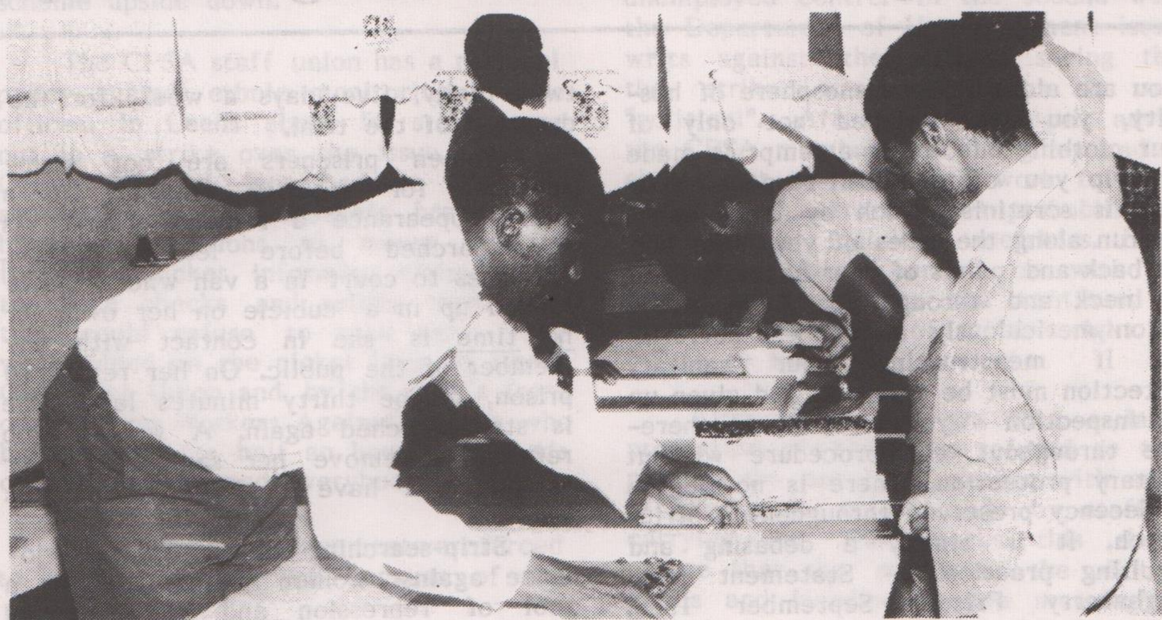
Sarmcol Workers T-shirt Co-op

The Congress of South African Trade Unions (COSATU) has supported the idea of organising a union for unemployed workers since it was formed in December 1985. It took a step towards making this a reality at a meeting in Johannesburg in January. Delegates from unemployed workers' groups linked to worker advice centres in Johannesburg, Capetown, East London and Port Elizabeth met to plan a national meeting of the organised unemployed and the launch of an unemployed workers' union later this year.