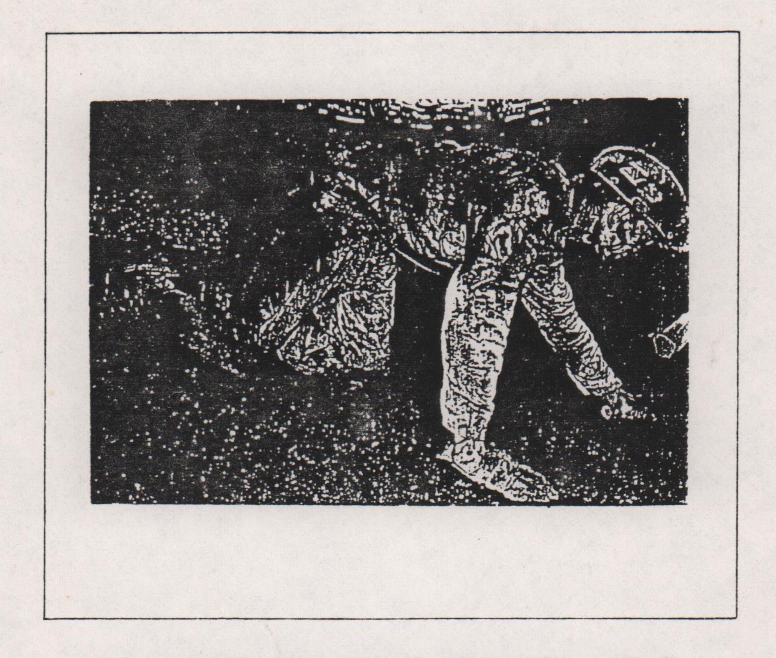
THATCHER WANTS US ALL TO CRAWL ON OUR FUCKING KNEES