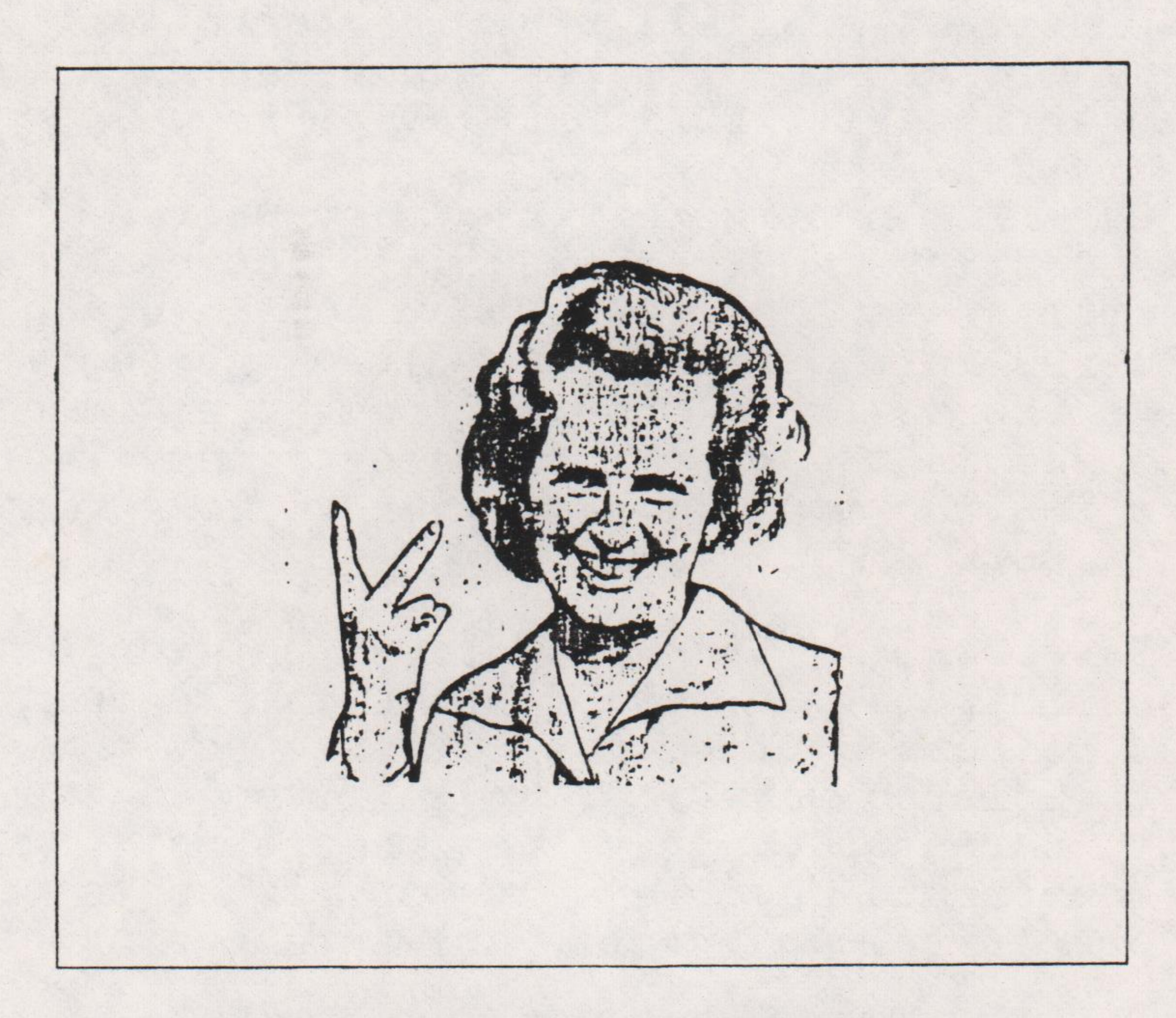
FUCK OFF THATCHER