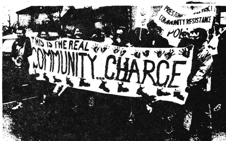
18 March, Glasgow: 15,000 demonstrate for non-payment!

All these groups have got organised by letter-boxing, running street stalls, holding meetings. Together, we can make the Poll Tax unworkable, but we need to support each other. If you would like to be an anti-poll tax street rep, letter-box your street, or hold a meeting at your work place, tenants' hall or community group, contact us and we'll speak at it. We've got 1,000's of anti-Poll Tax leaflets waiting to be distributed too!