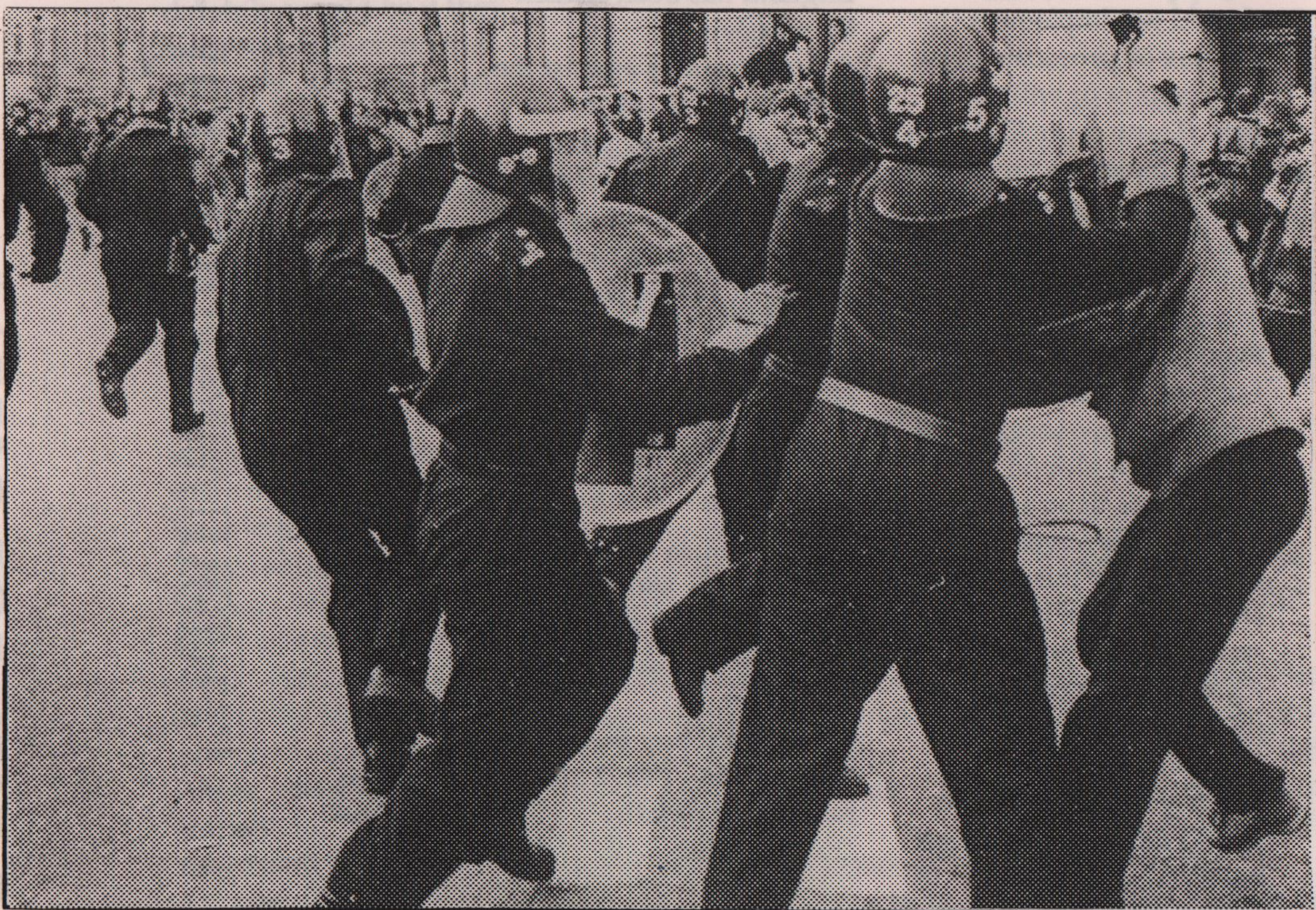
The March 31st demo - we must defend those arrested

We must ensure that defendants are not left isolated and that this campaign becomes fully