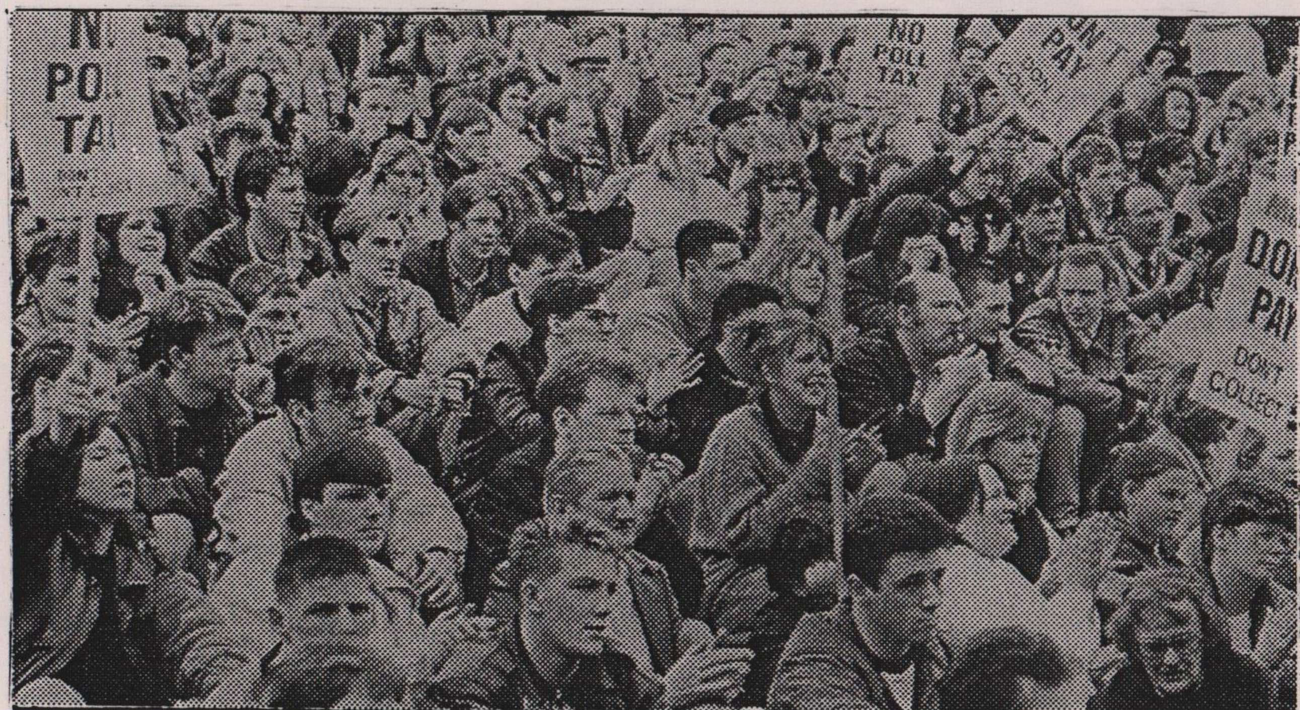
There are 1.5 million non-payers in Scotland!

Anti-poll tax unions must increase pressure on councillors not to apply to courts for liability orders. Individuals cllrs should be lobbied. Sympathetic councillors should be approached and asked to move resolutions at full council meetings calling on the council to refuse to refer to the courts to recover poll tax payments. Anti-poll tax unions should try and get copies of the court summonses prior to them being sent out so mass leafletting can be conducted preparing people and answering worries that will be raised. By now telephone trees should be well established and well publicised in the local areas. The court summonses will frighten people - make sure the campaign reaches those