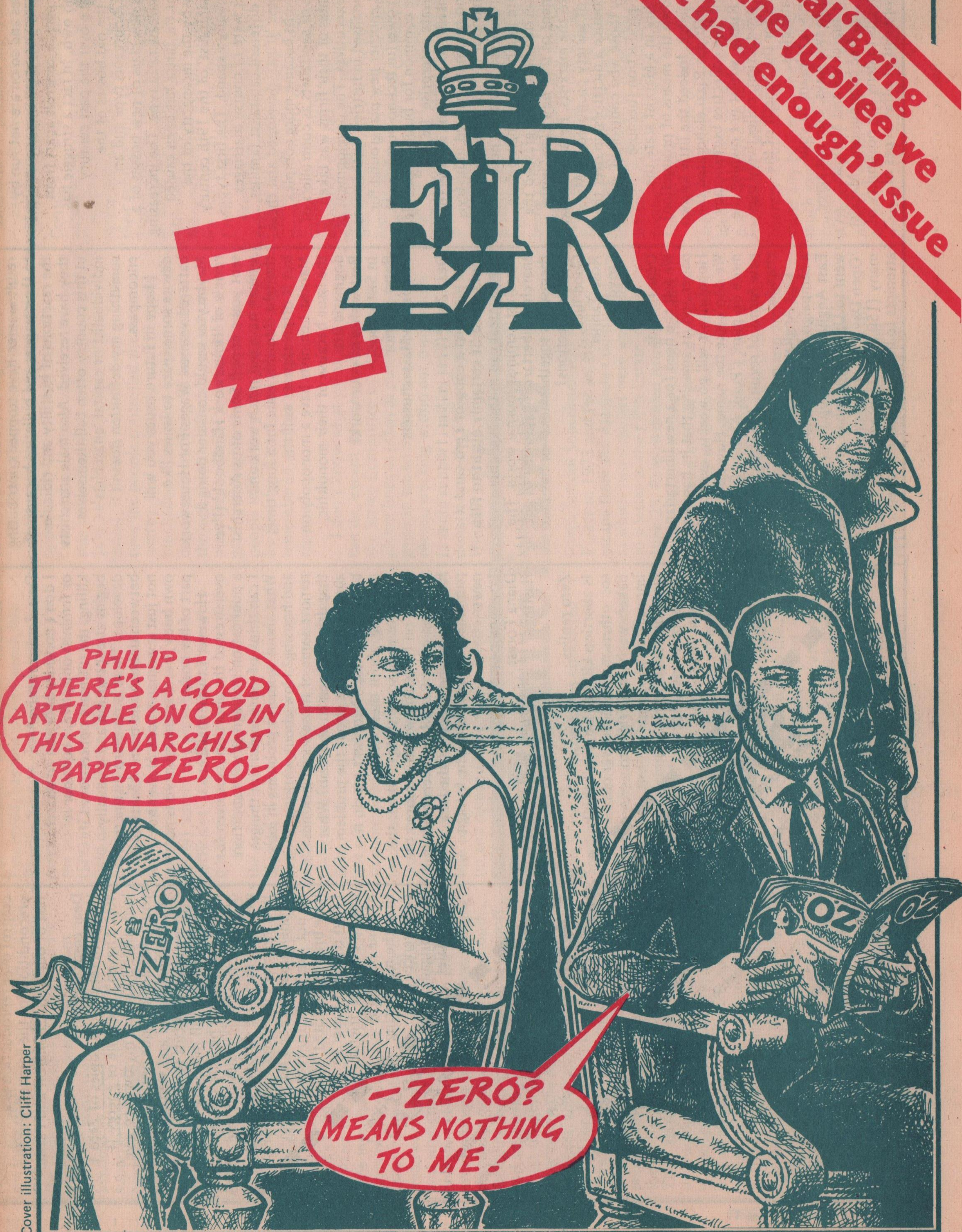
Cover illustration: Cliff Harper

Special 'Bring back the Jubilee we haven't had enough' Issue