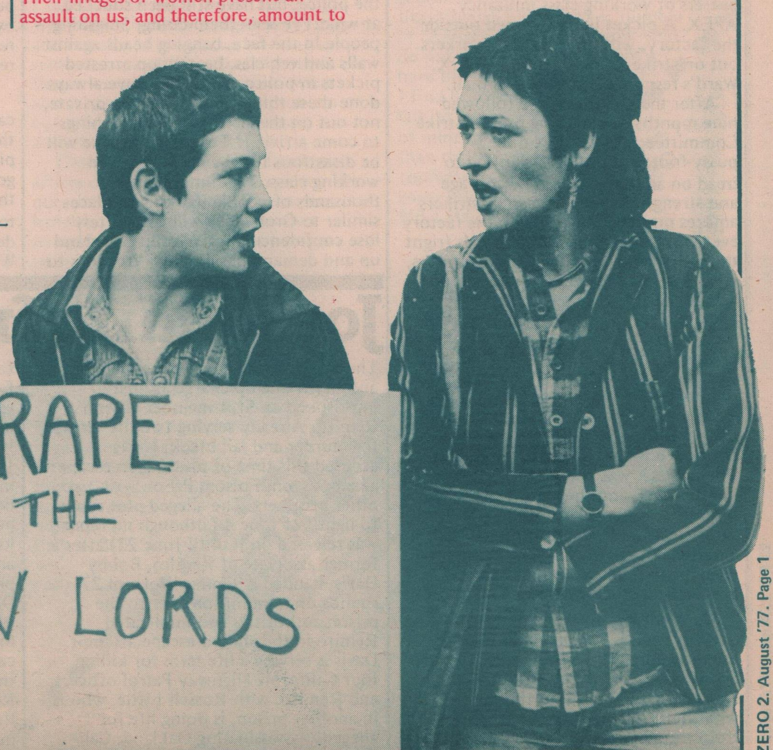
June 28. Women Against Rape picket the Law Courts

a prescription to rape. Why do we feel that rape and sexist images of women are essential radical feminist issues? Sexism is how male power operates against women; rape is the inevitable brutal expression of that power. All men are potential rapists, and therefore all women are potential rape victims. The reality of rape can affect all women irrespective of age, race or class. Women are raped every day of their lives by the results of sexism and its agents—Capitalism, the family, religion, the media, education, psychiatry etc.—which negate our autonomy and individuality and deny our right to self definition and determination. Rape is a reality that all women fear; it is the ultimate weapon which keeps us in our place. We must start to expose the Patriarchy's most blatant forms of intimidation by making an attack on rape. Rape Group, c/o 42 Earlham Street, London WC2.