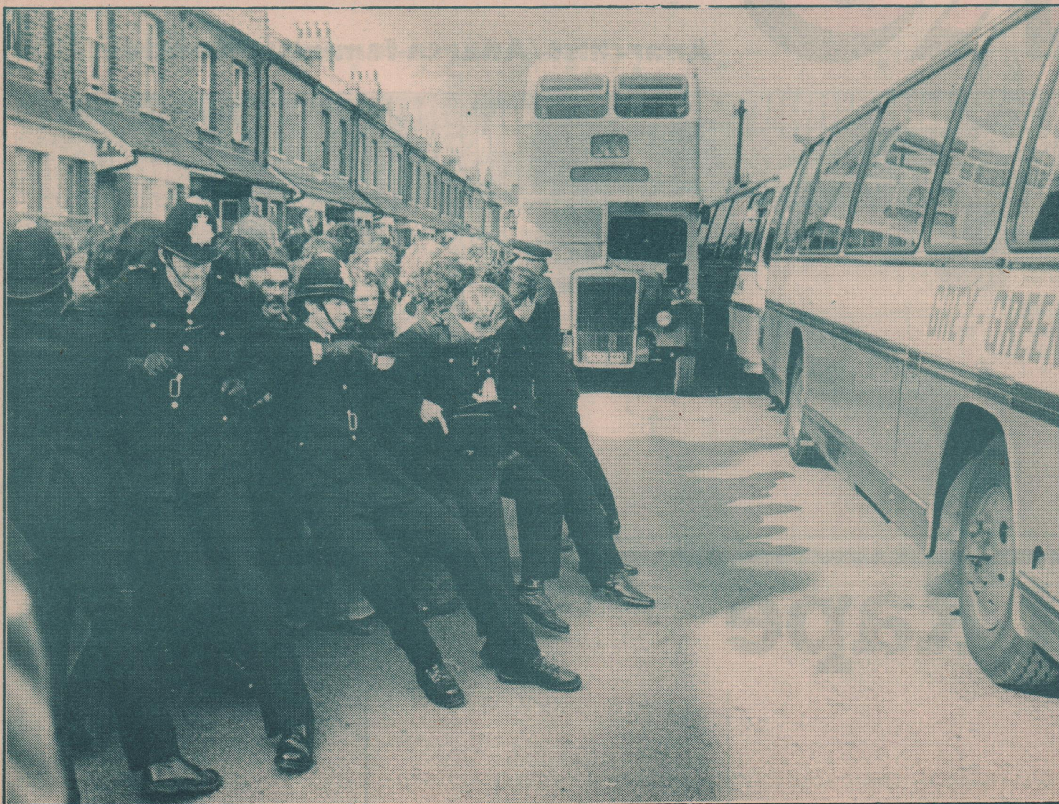
June 29. SPG clear the way for "bus of fear"

Grunwicks—just one non unionised back street sweat shop of the hundreds in North London and the East End which are living death to work in. The boredom and frustration, lack of solidarity, and the feeling of resignation nearly drive you insane, using mainly immigrant workers, continually harassed and insulted by supercilious racist supervisors and arrogant employers, overtime is compulsory and wages pathetic.