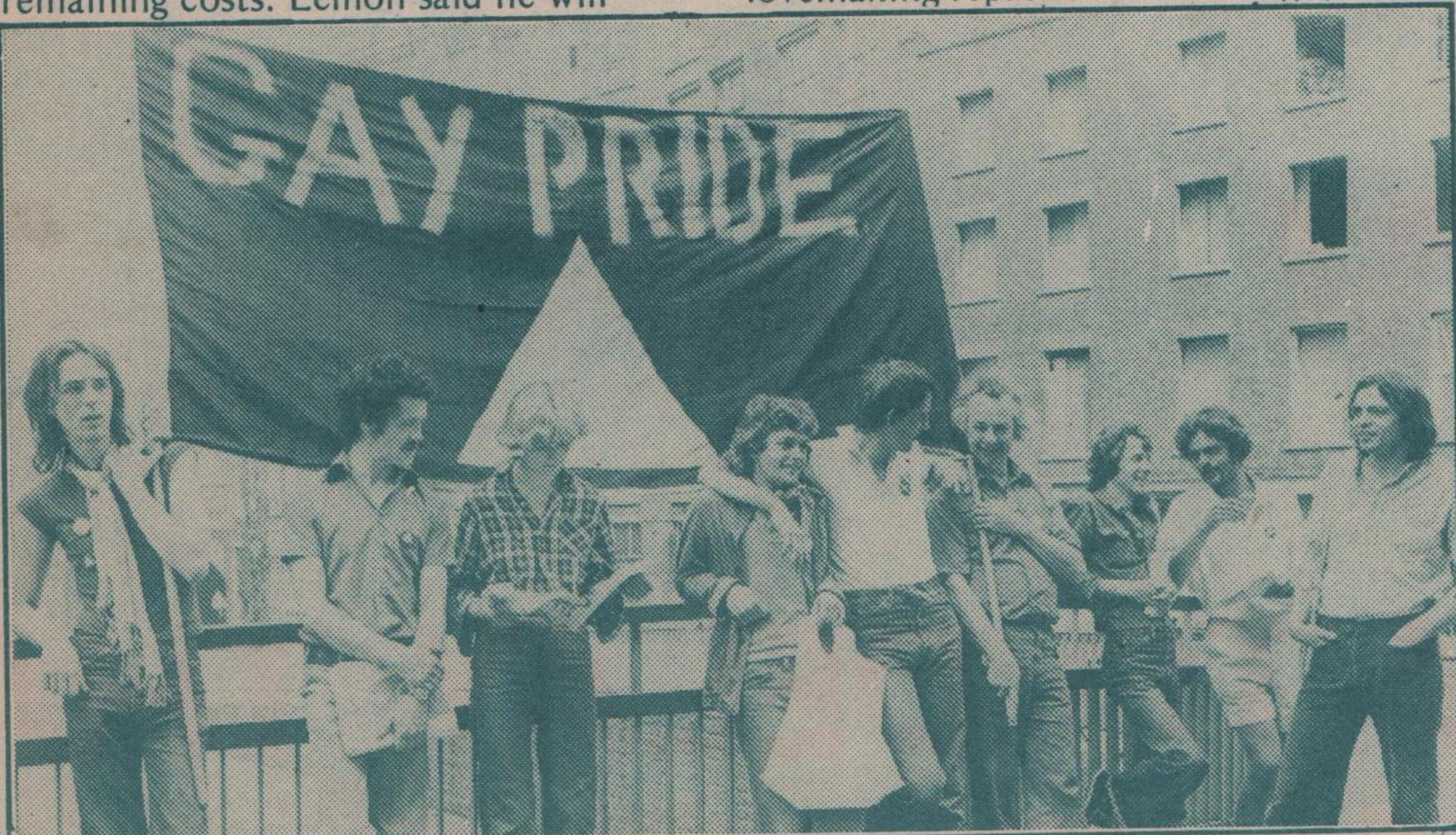
July 4. Picket outside Old Bailey during Gay News trial.