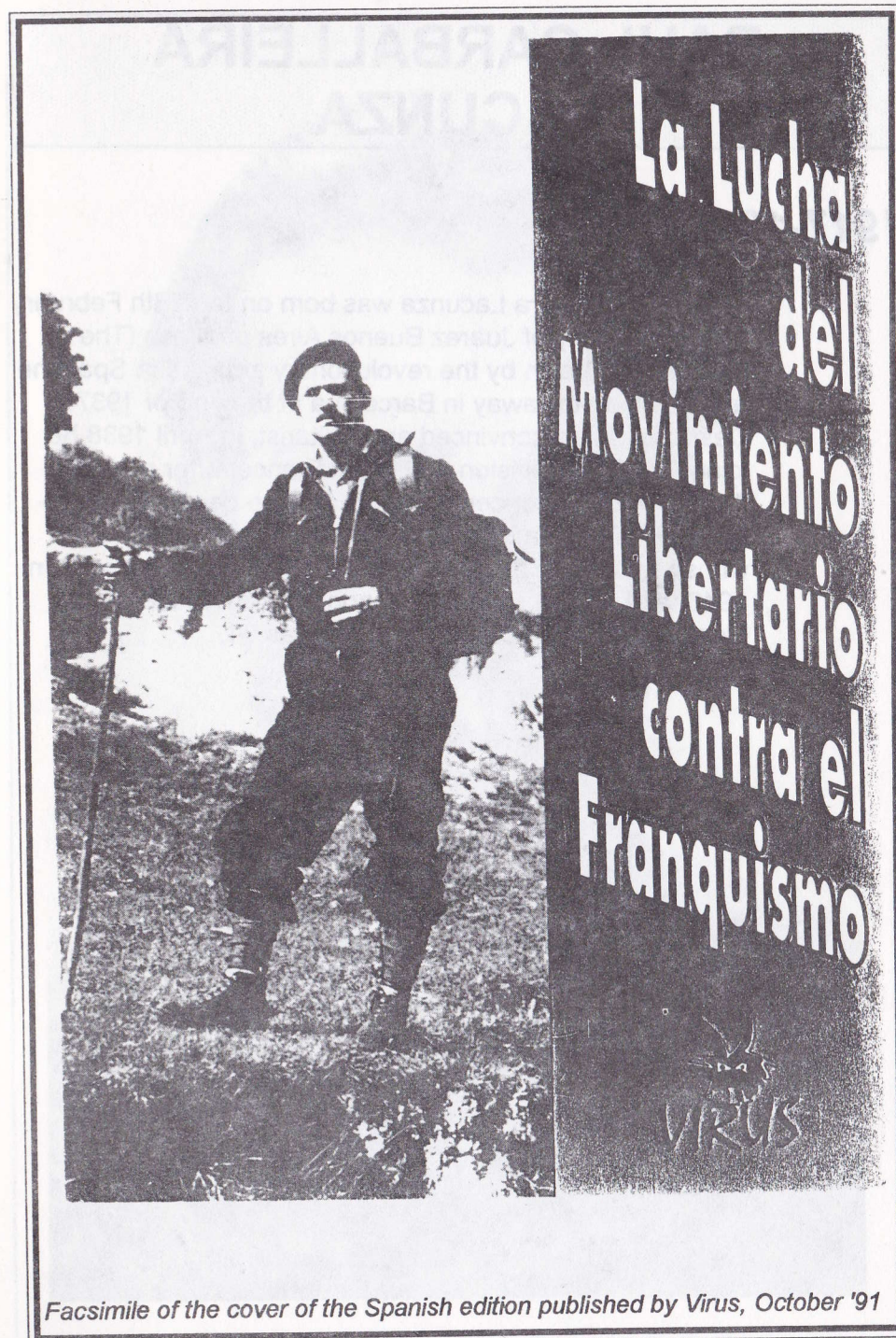
Facsimile of the cover of the Spanish edition published by Virus, October '91

It is regretted that we cannot reproduce the exact Spanish and Catalan orthography, both with accents and the 'tilde'.