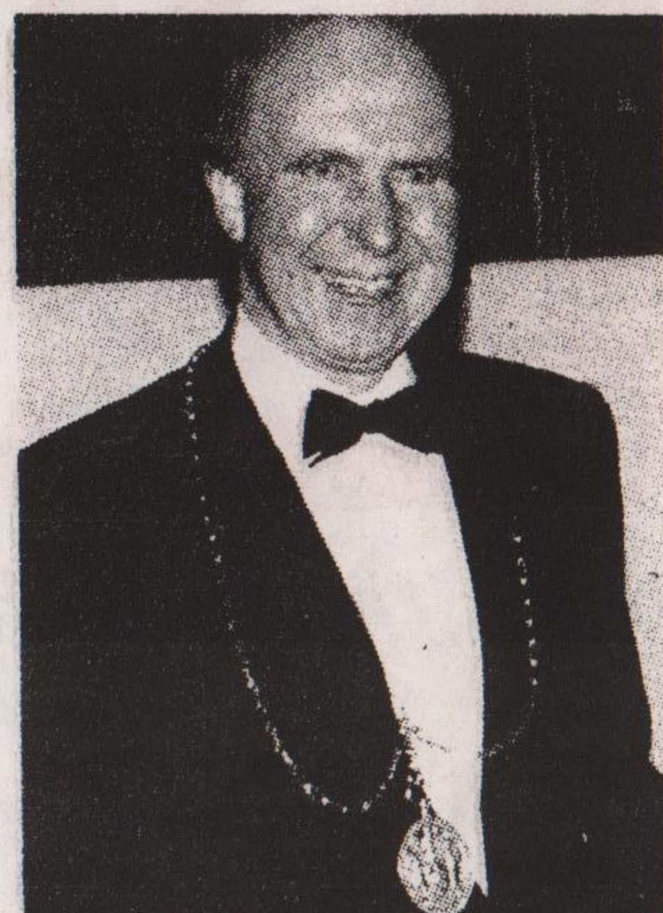
● Lord Lally of Glasgow, CBI, IMF, Press Bar and Cross

If you wish to register your opposition to the systematic erosion of Glasgow Green and other municipal parks and associated properties, join the picket of the City Chambers on Wednesday 21st November and lobby your own councillor.