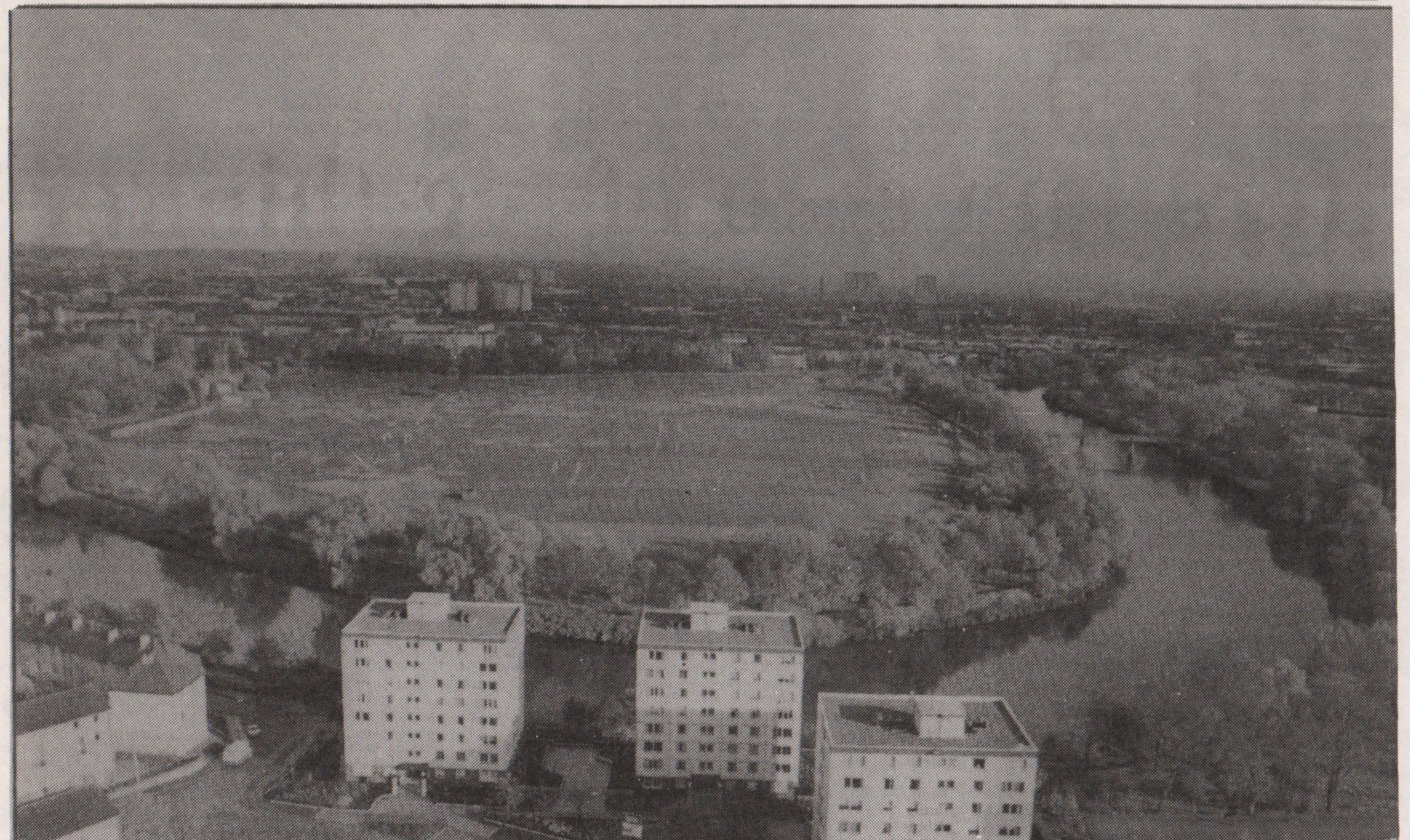
● Flesher's Haugh Events like the Big Day and 5th November showed its real potential as the People's Park