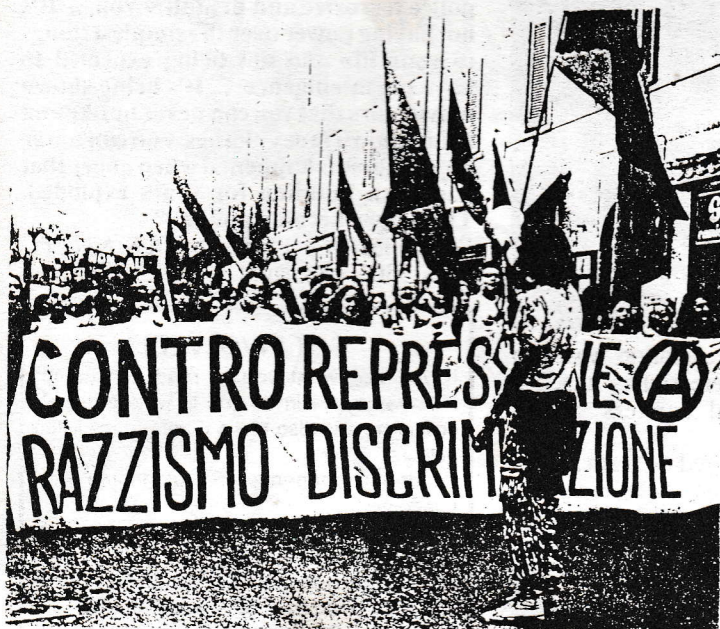
"Against Repression, Racism Discrimination: anarchists on the streets of Pisa, Italy on 9 May"

March. Hundreds demonstrate in the city centre against fascist activity.