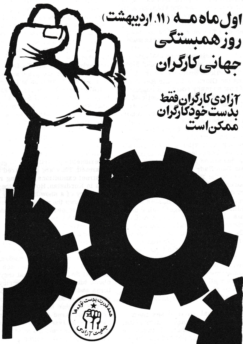
MAYDAY POSTER from TEHRAN LIBERATION GROUP "THE FREEING OF THE WORKERS IS THE TASK....."

The economy is generally in a mess. There are widespread shortages of even essentials like bread. The government keeps saying that they are going to do something about it and regulate the price but it seems to make little difference. Consumer goods are in increasingly short supply and prices are rising fast. Unemployment is already high, and rising. People are afraid to take their holidays, in case the job has disappeared when they get back. Many supplement their income by small scale trading, cigarettes, newspapers, posters, gadgets, anything small, and saleable, hawked from car to car at traffic lights or from makeshift stalls at the roadside. (The government is moving to ban these in response to pressure from 'legitimate' shopkeepers). The basis of economic activity is still oil, but production of this is down. Much of the extraction mach-