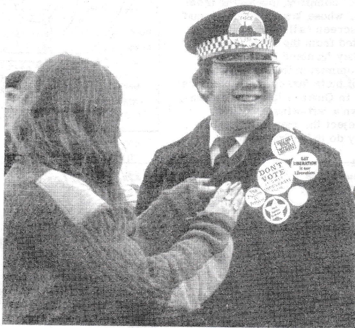
THE FARCE IS WITH YOU!