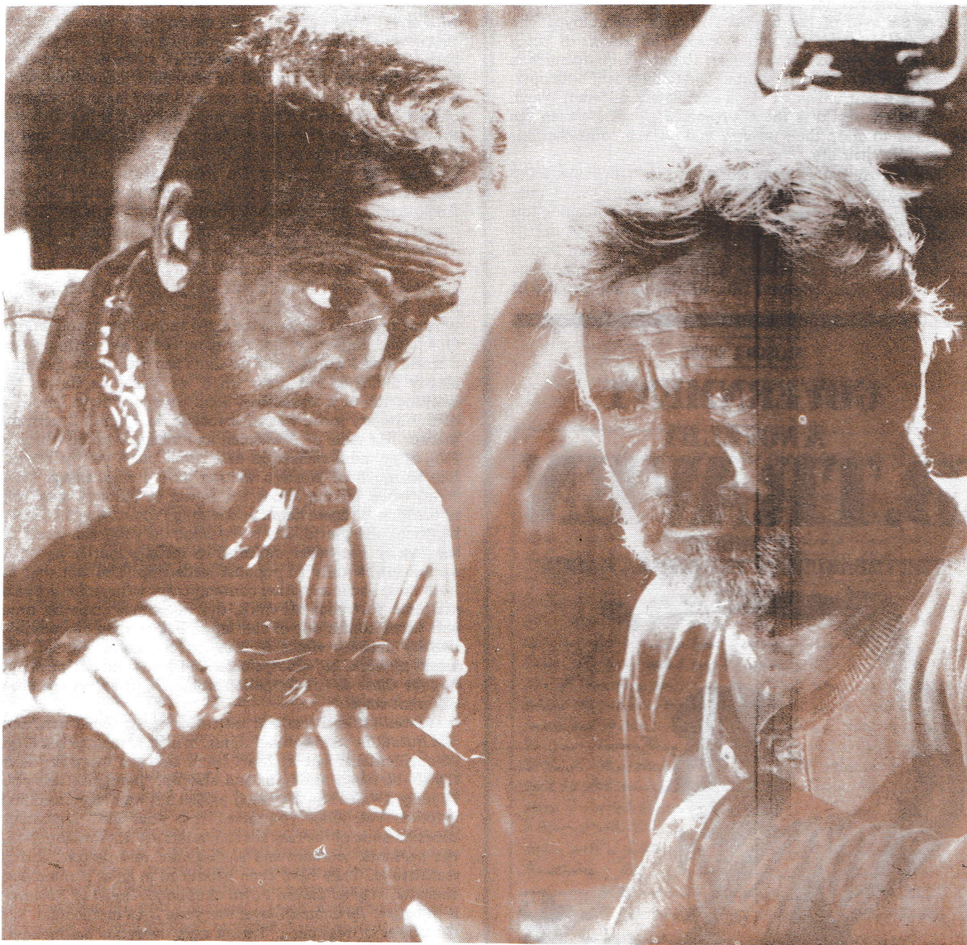
THE TREASURE OF THE SIERRA MADRE (1948). Above, Walter Huston and Humphrey Bogart in a scene.