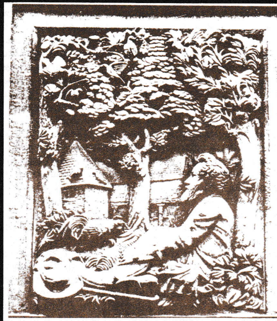
William Morris's Socialist Diary

The History Workshop Journal was originally described as 'a journal of socialist historians', but has now been renamed 'a journal of socialist and feminist historians'. It has always tried to cover sexual as well as class politics, and feminism has always been a strong component of its socialism, so the change of subtitle only confirms an existing situation. It tries to maintain other kinds of balance as well – between various periods of history, between various parts of Britain and of the world, between professional and amateur historians, between abstract and personal material, and so on. An unfortunate balance is that between interesting and boring material, which makes the journal seem rather expensive for most outsiders.