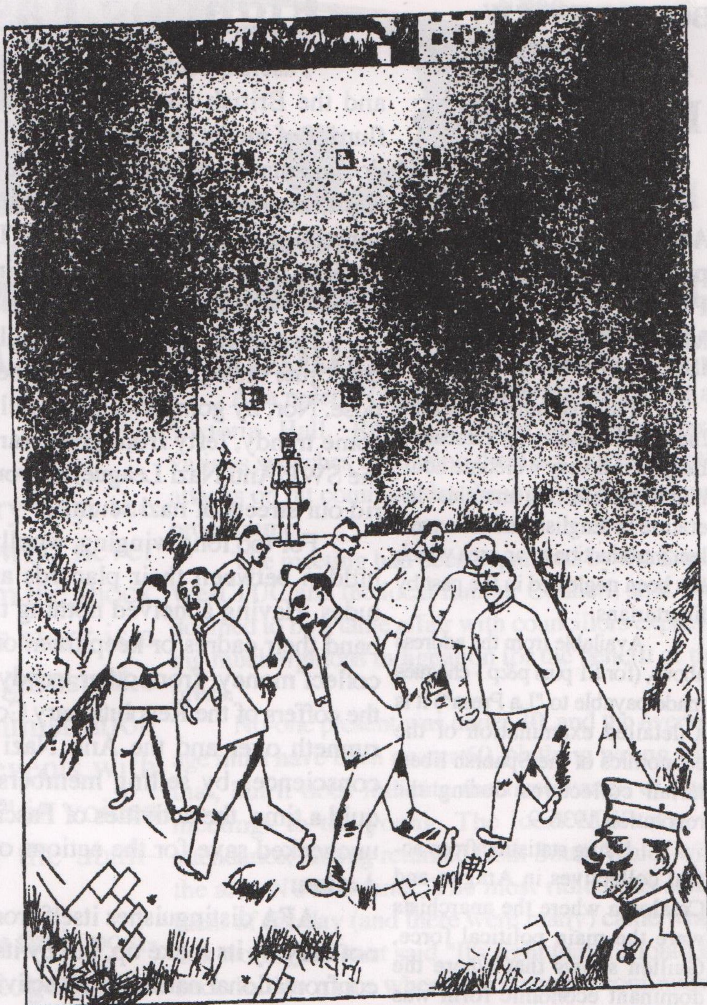
Workers' sanatorium: Let the proletariat have light and air! George Grosz's view of Plötzensee prison, Berlin, 1921.