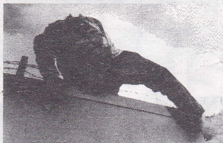
Going over the top - campaign style

Ladies" threw pedestrian crossings over an eight foot fence topped with barbed wire and helped 150 pedestrians over. They swarmed the machinery and climbed the 80 foot cranes, bringing work to a stop. Estimated cost to the road builders: £50,000. When police tried to scare four people down from the crane by threatening to do them for criminal damage (they'd interrupted a concrete pouring operation) they underestimated the resolution of the crane sitters, who shouted "you must be joking - look around you, THAT'S criminal damage". The humour and determination of the Lollipop Ladies and the Concrete Four had set the tone for Operation Roadblock. Over the next four weeks 1,200 people stopped the bulldozers. Pensioners being hauled off work sites by embarrassed policemen, and school kids spurring weary campaigners into 'just one more action' are scenes which will never be forgotten.