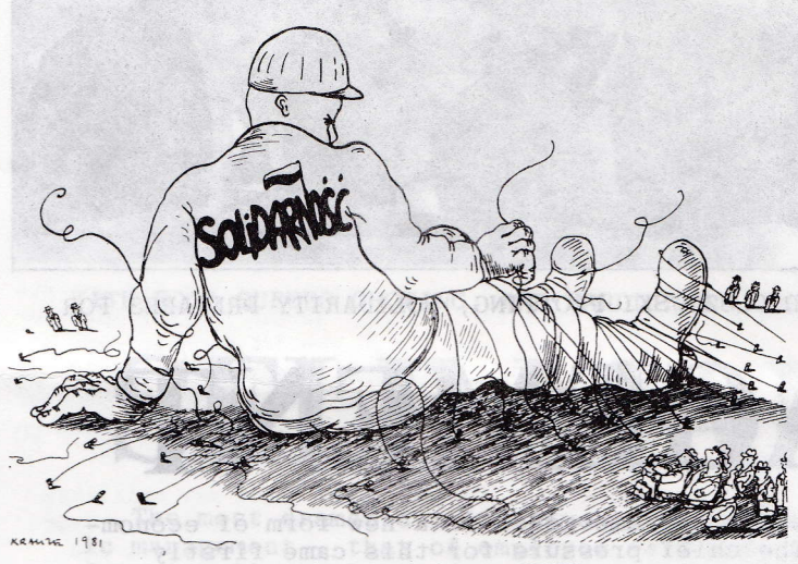
Taken from L'Alternative, May-August 1981.

The Polish events have evoked a reaction even in China. At first the official Chinese press gave rather full reports of the strike waves and occupations in Poland in the late summer of 1980. The government of Deng Xiaoping evidently calculated that any news which