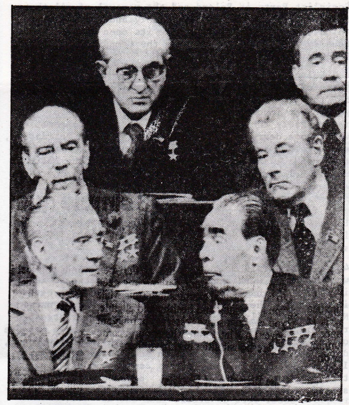
Will they be welcome at Labour's Conference?

The Socialist Party of Poland was forcibly disbanded in 1948, many of its members jailed and its organisation compulsorily merged into that of the so-called "Polish United Workers Party", in fact the Communist Party of Poland masquerading under another name. The Socialist Party of Poland still exists in exile. In Poland it still remains an illegal organisation. In Poland the Socialist Party's press is banned. Socialist Party members are denied the right to organise. If socialists seek to hold public meetings they are liable to be clapped in jail. Socialists cannot run candidates for elections either at local or national level in Poland, nor are they allowed to hold office on any public body.