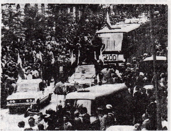
Hunger marches block Warsaw city centre.

The government in turn accused Solidarity of fomenting unrest over the shortages. It has tried to impose