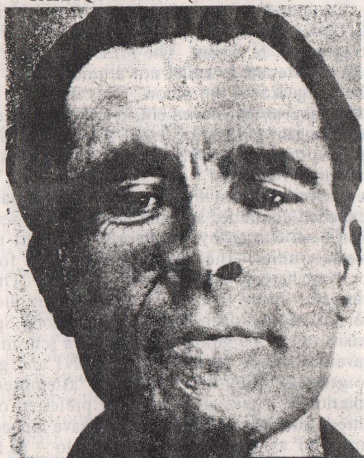
CARAQUEMADA (Burnt Face)

The English obituarists of Franco dwelt on the fact of how he has "tricked" Hitler into not supporting him, how Hitler said he would rather go to the dentist than have another such interview. But why didn't Hitler simply use force as with other European countries reluctant to help him to the utmost!