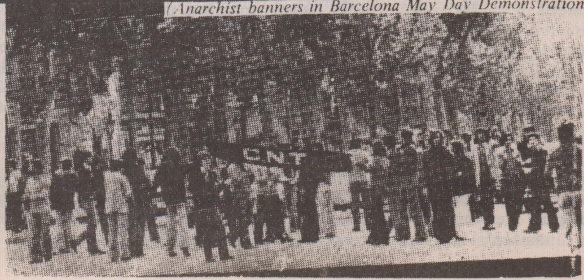
(Anarchist banners in Barcelona May Day Demonstration)