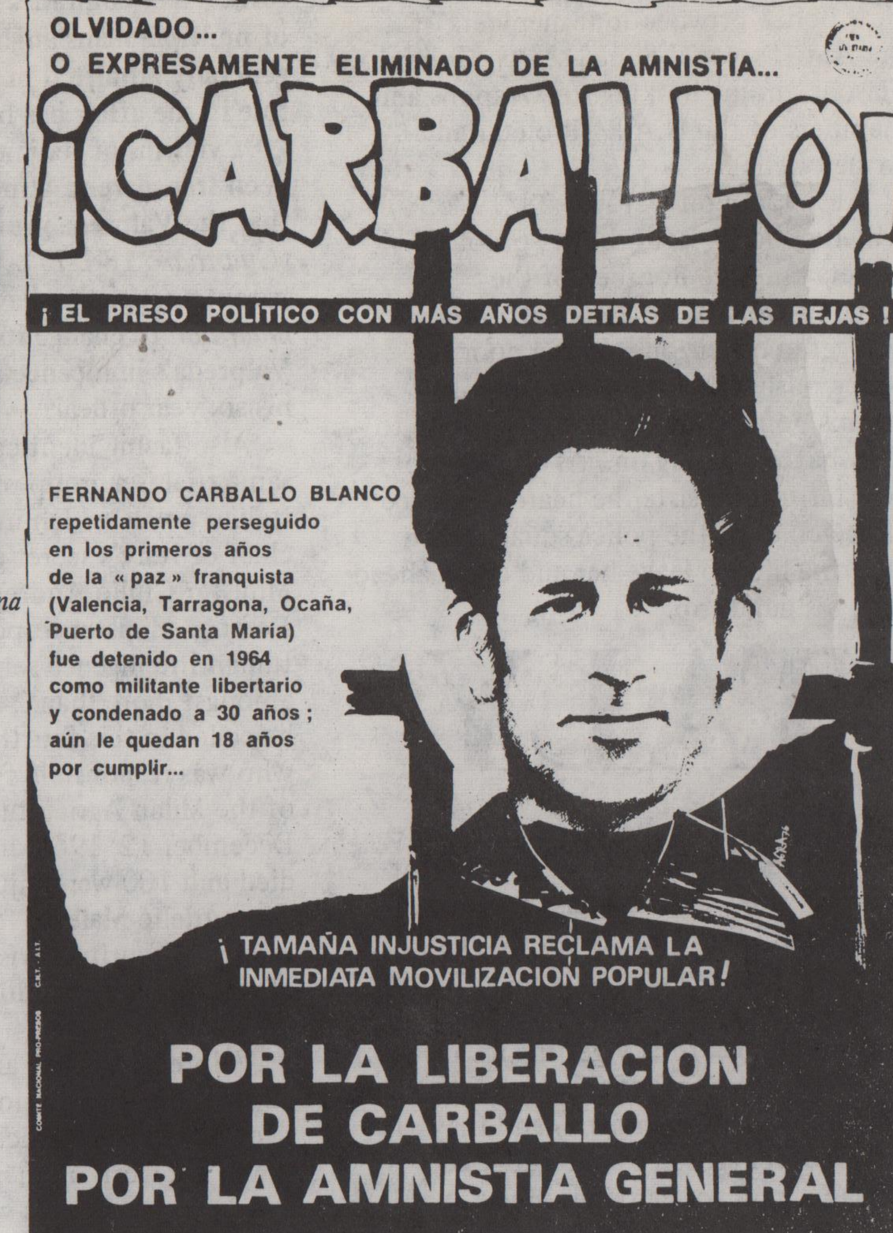
The two coloured poster published and distributed in thousands throughout Spain by the Comité Nacional pro-Presos.

Financial support for the CNT can be channelled through Black Flag. All contributions should be clearly marked “C.N.T.”