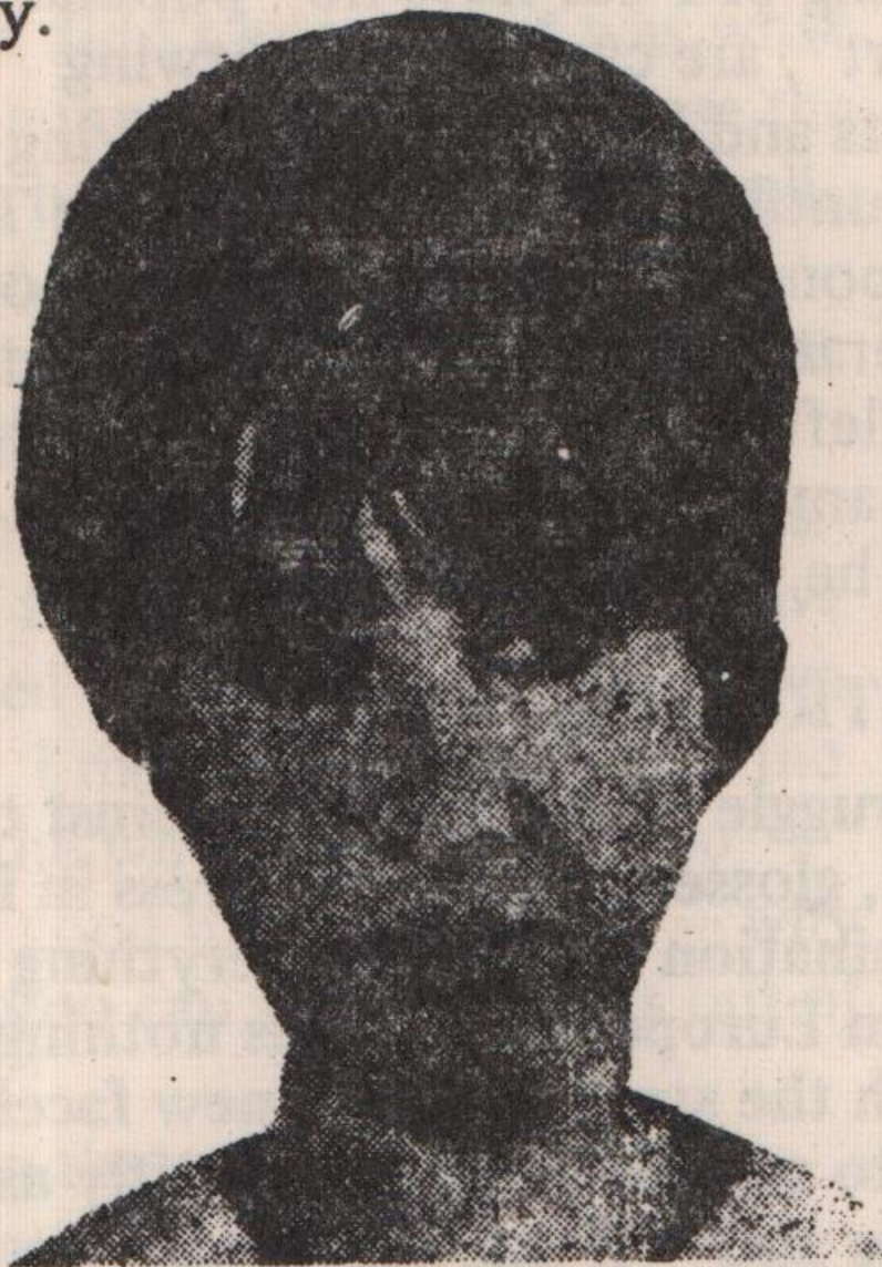
● Norma Esther Arrostito