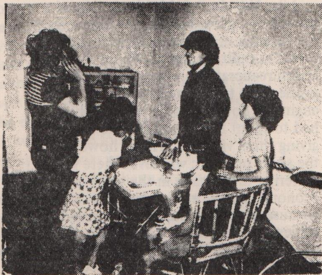
Argentinian soldiers carrying out house to house document checks and searches.

THE PICTURES OF THE MURRAYS ON PAGE ONE ARE AVAILABLE, PRICE 5P. EACH FROM THE LONDON DEFENCE GROUP, 29 GROSVENOR AVE. N5.