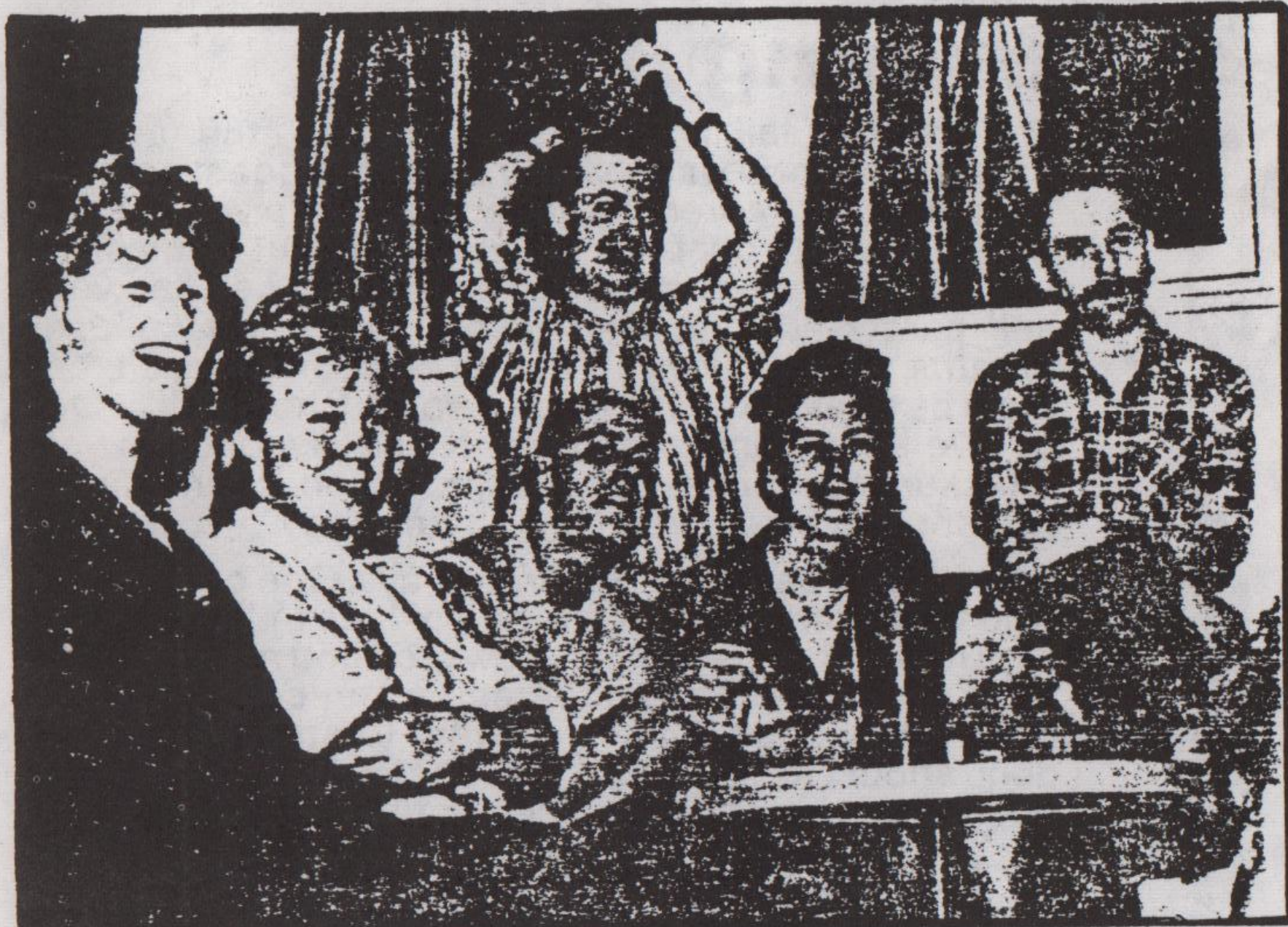
Young lesbians & gay men enjoying a performance of "The Best of Friends" at the recent Winter Festival in Nottingham.

A gay sports organizer is wanted to help set up a gay sports group in the city, covering the A-Z of sports, including Badminton, Swimming, football, table tennis, and others. Essential qualifications needed are an enthusiastic interest in sports and groups, a flexible non-bossy attitude towards others and someone who is glad to be gay. You could be an arm-chair sports person or one who takes part. Interested? Then contact Nottingham Gay People's Centre, Box 11, 118 Mansfield Road, Nottingham.