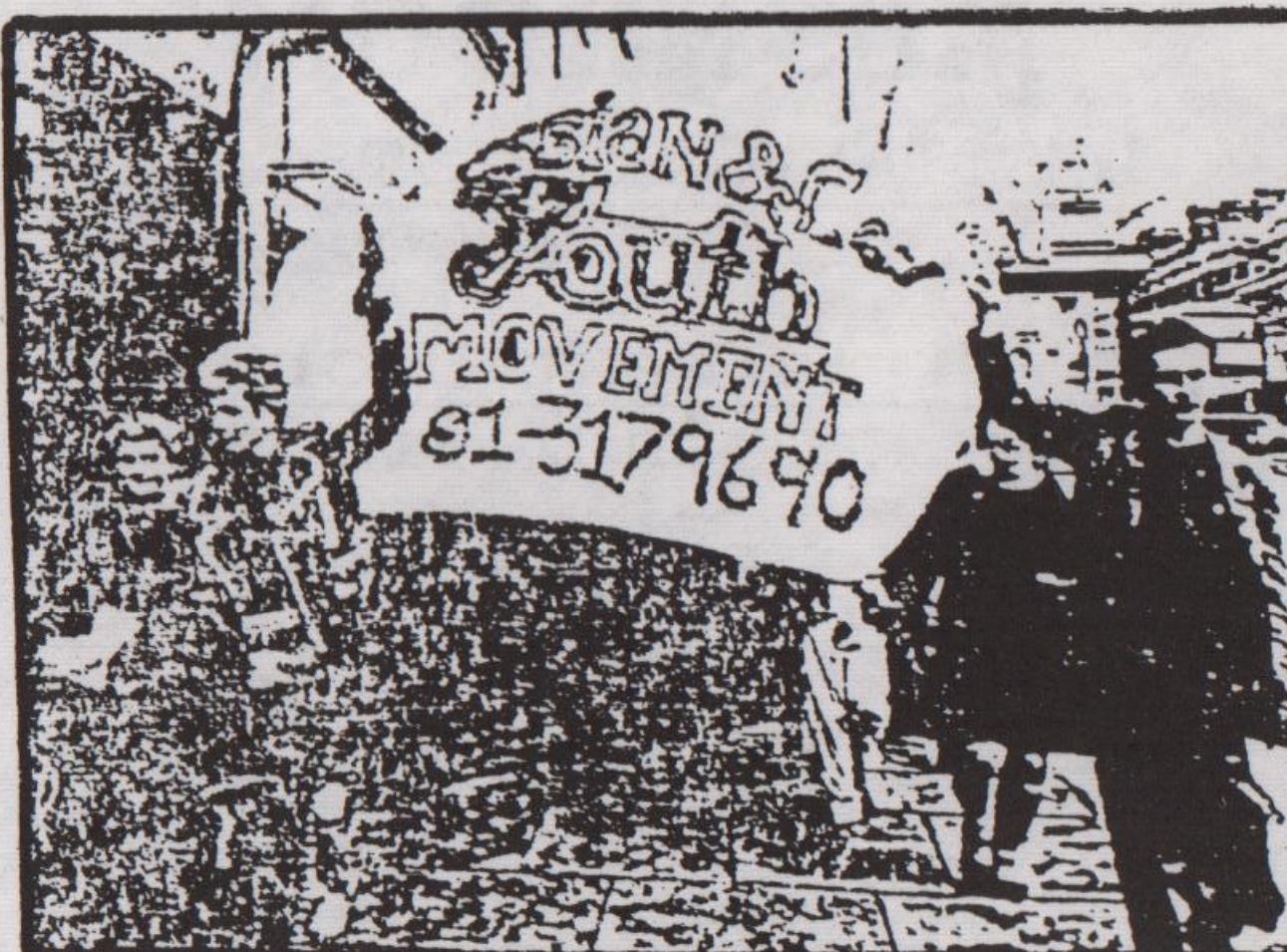
A group of young lesbians and gay men en route for their rally in the City Centre.

Derby's Green Lane Gallery will be holding a David Hockney poster print exhibition during the months of February and March. Derby's Green Lane Gallery is in the City Centre and has a large car park. Its licensed gay bar is open every night of the year from 8.30pm.