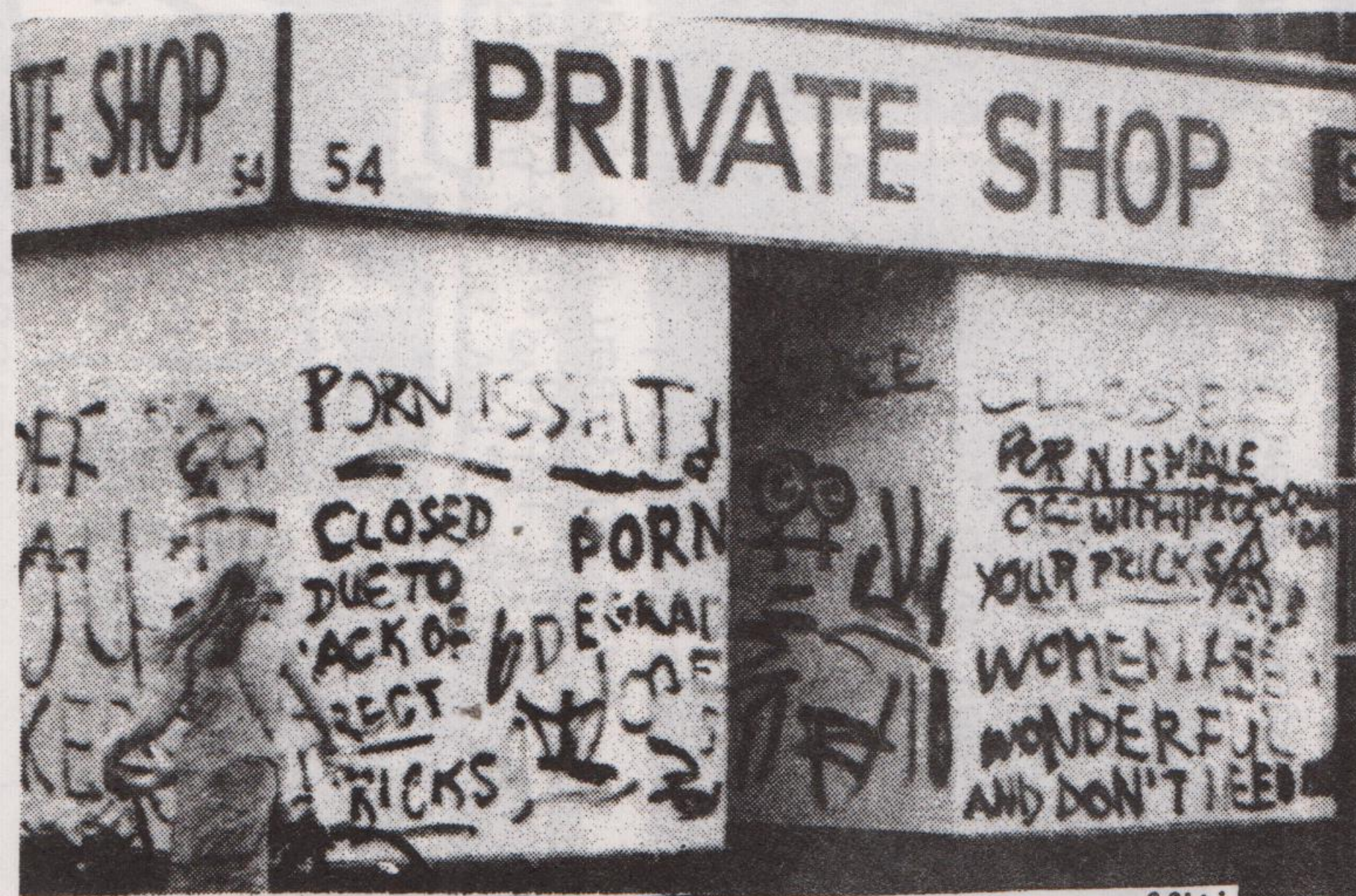
Women protest against pornography using graffiti on a shopfront in Oxford.