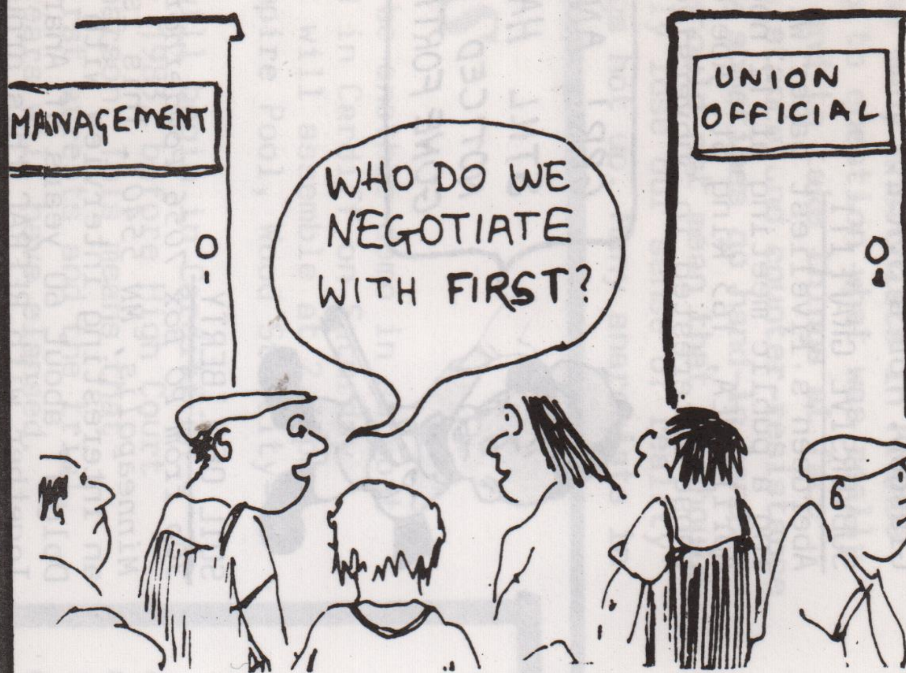
Class Struggle Hull