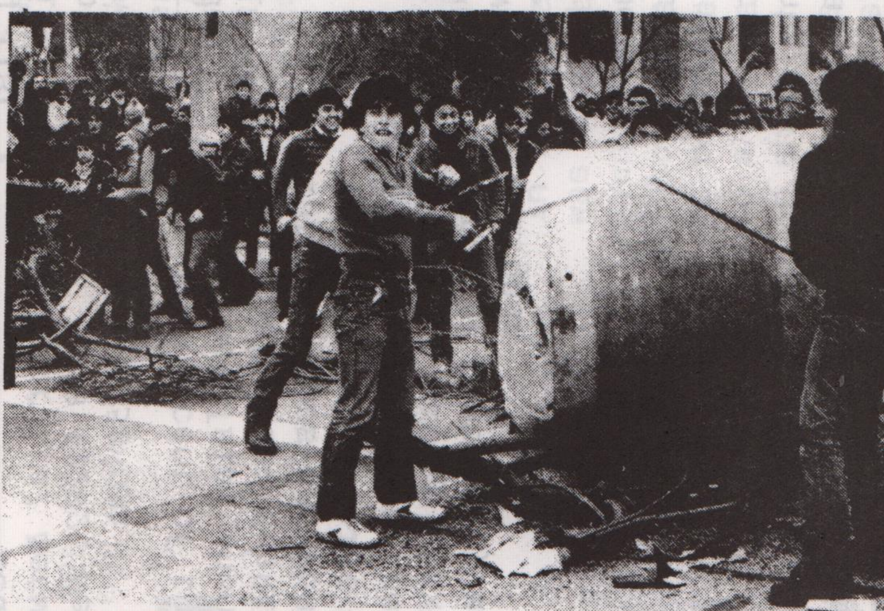
Students in Santiago beat a drum to voice growing discontent

In the southern part of the capital rioting broke out and the army was called in to help the police. In the centre of the city refuse and old tyres were set alight in the streets to form barricades. For the first time since Pinochet came to power 10 years ago the army was deployed to provide back-up to the police to quell a riot.