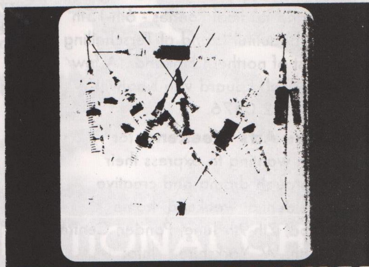
INFECTION SPREADS through sharing works