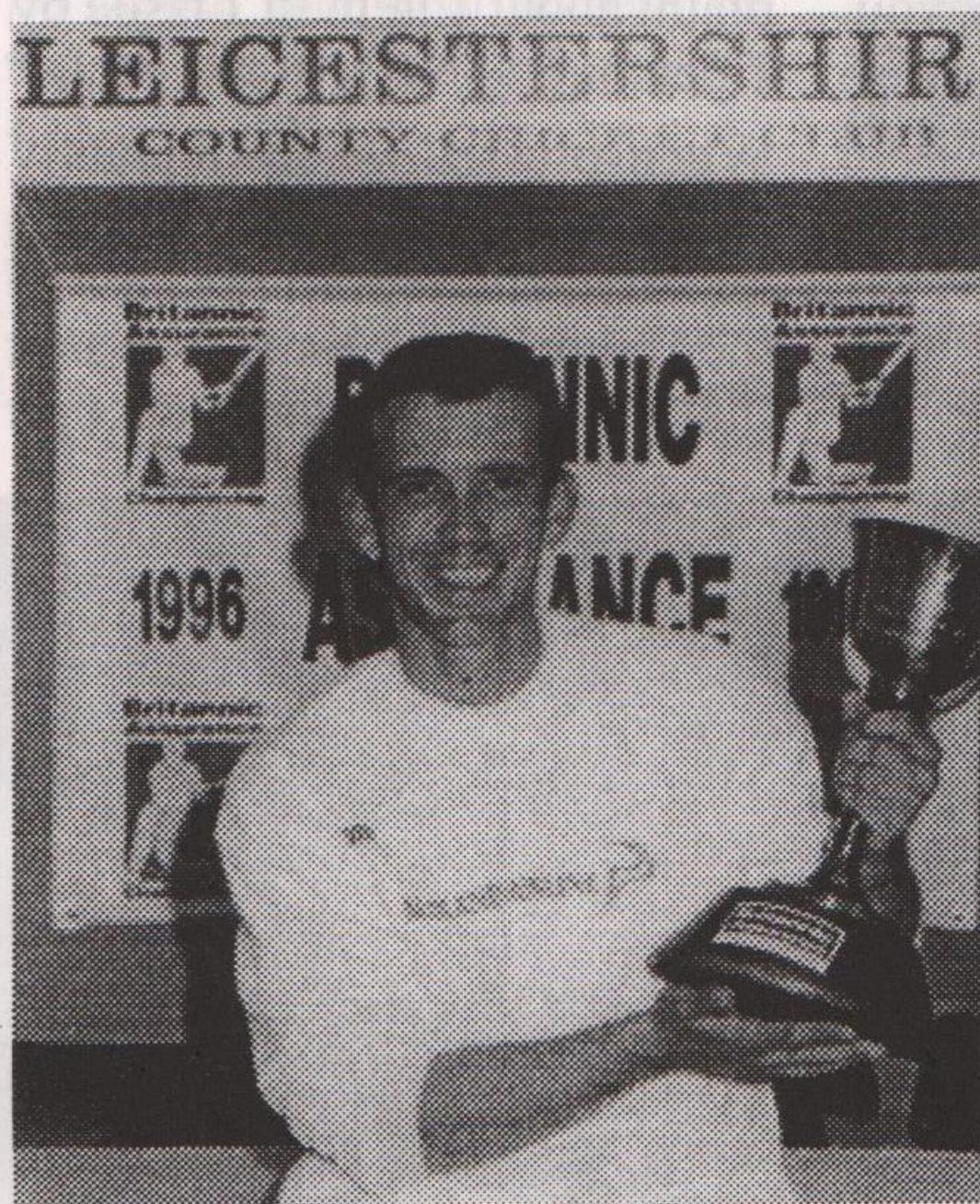
Sponsored by Midland Mainline

A spokesperson for Midland Mainline told outright! that it wasn't a big deal - the company just felt it was about time that all