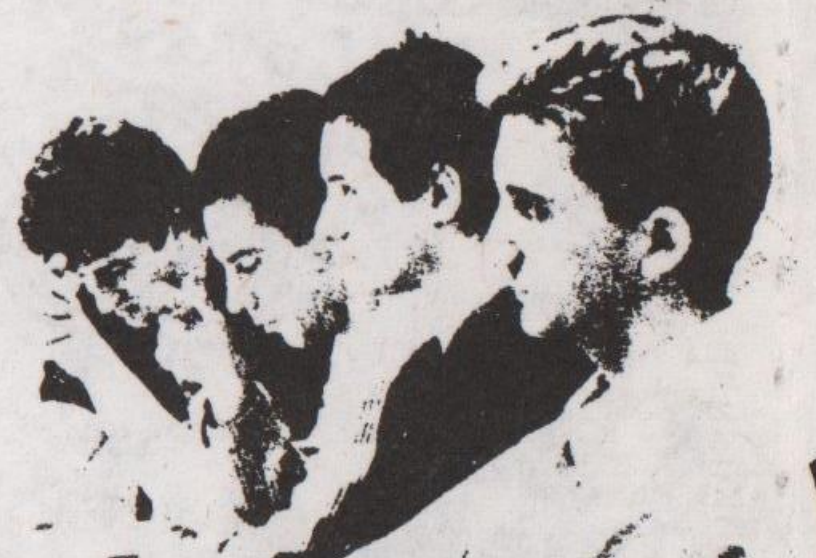
Delegates in pensive mood at recent CHE Conference held in Nottingham at the George Hotel, Hockley.

With laboratory testing facilities on hand results will be much quicker, and in total confidence, remembering that the information will not be shared with anyone else. In this age of specialisation, these are the experts, so it makes sense. So don't keep putting it off; they are there to help. (Next month, GAY NOTTINGHAM will look at some of the health problems the clinic deals with, including AIDS, and we talk to a gay man who went for a test.)