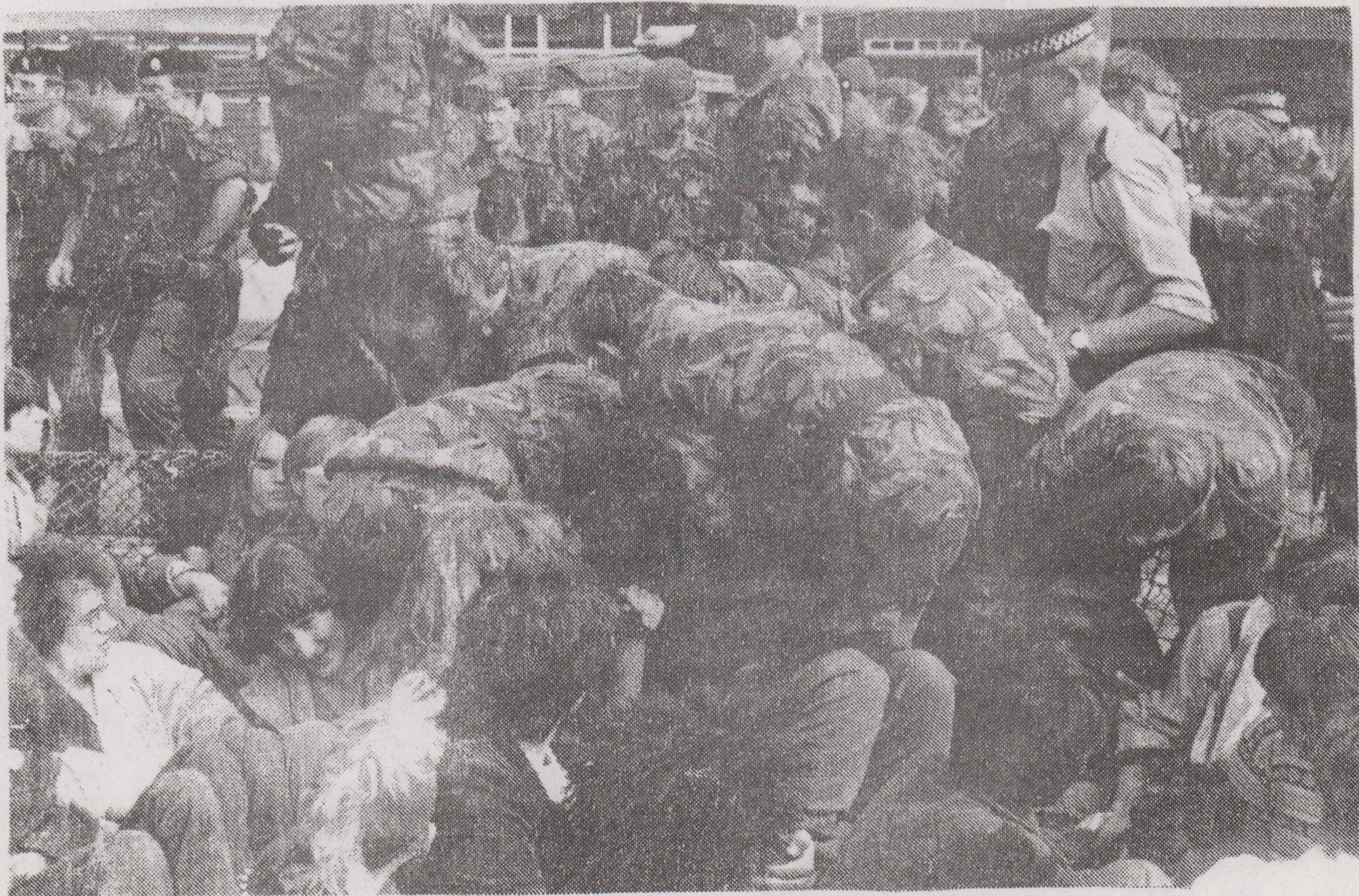
THE ARMY WERE USED FOR THE FIRST TIME AGAINST PEACE PROTESTERS AT THE RECLAIM CHILWELL ACTION. HERE THEY MOVE IN TO REMOVE PROTESTORS FROM SITTING ON A SECTION OF PULLED DOWN FENCE.

U.S. troops out of Chilwell U.S. bases out of Britain.