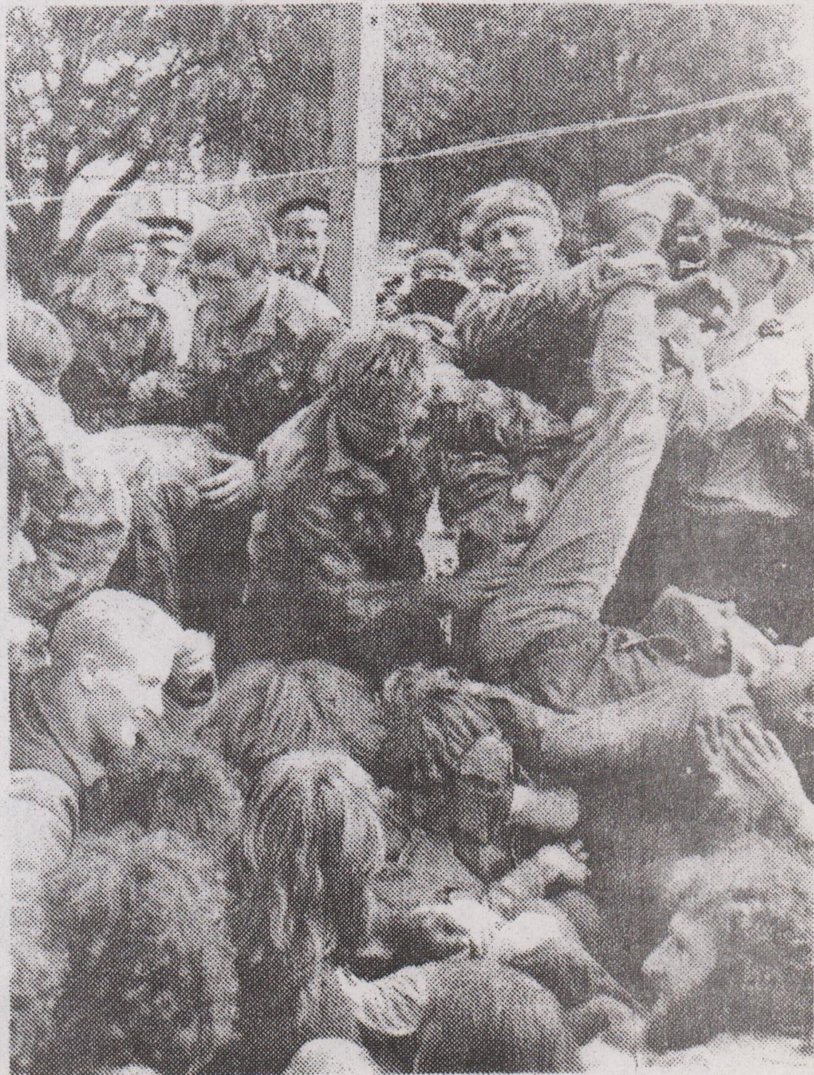
A SCENE FROM THE 'RECLAIM CHILWELL' ACTION.