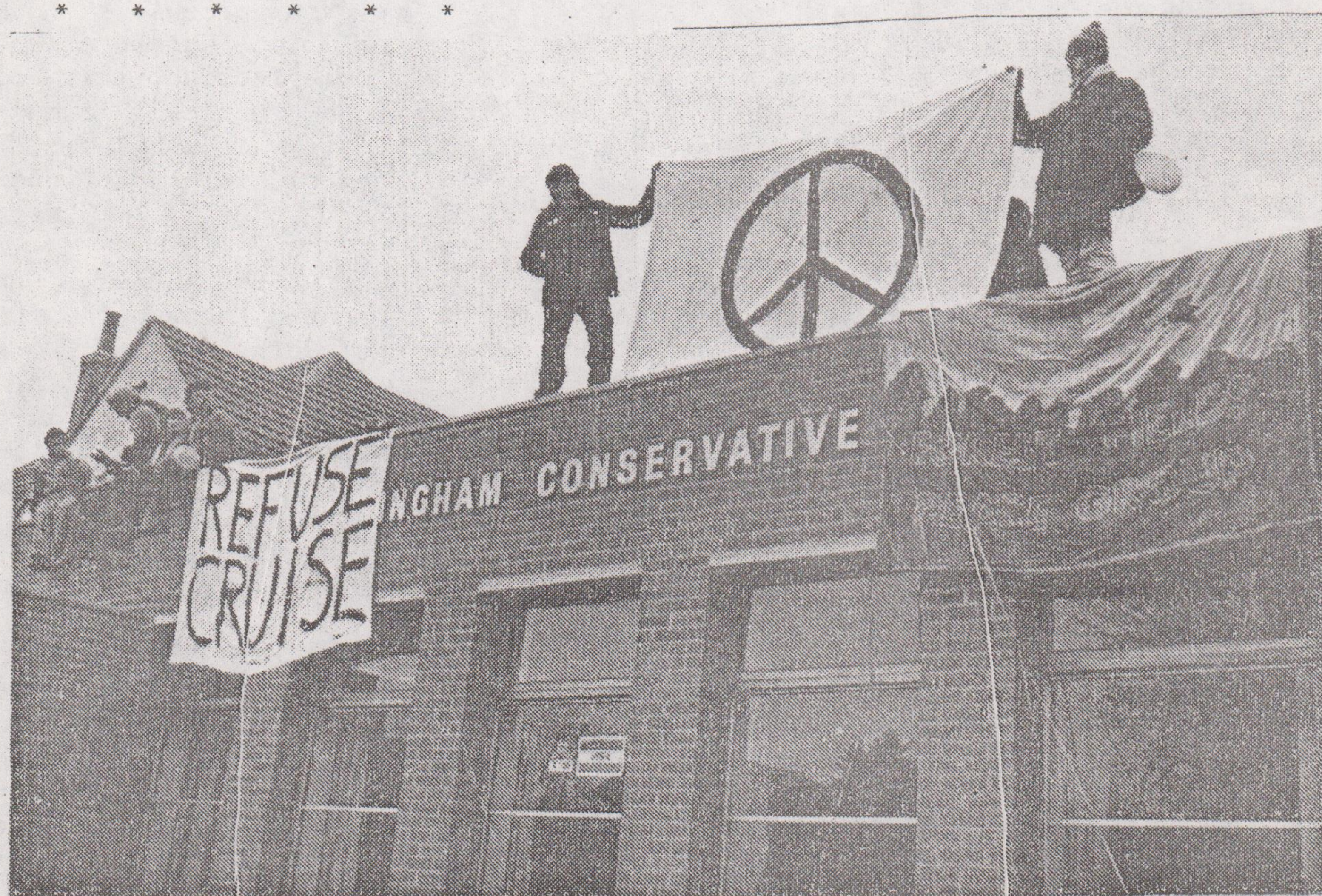
FFPG occupation of Conservative Party Headquarters, Nottingham, on 6th November, the day after the announcement that the second flight of Cruise missiles had arrived at USAF Greenham Common.

It has been decided to demonstrate on both the day we hear about the exercise and the day after- to catch even more people as they innocently drive home to their slippers and tipples, unaware that FFPG is about to strike again!