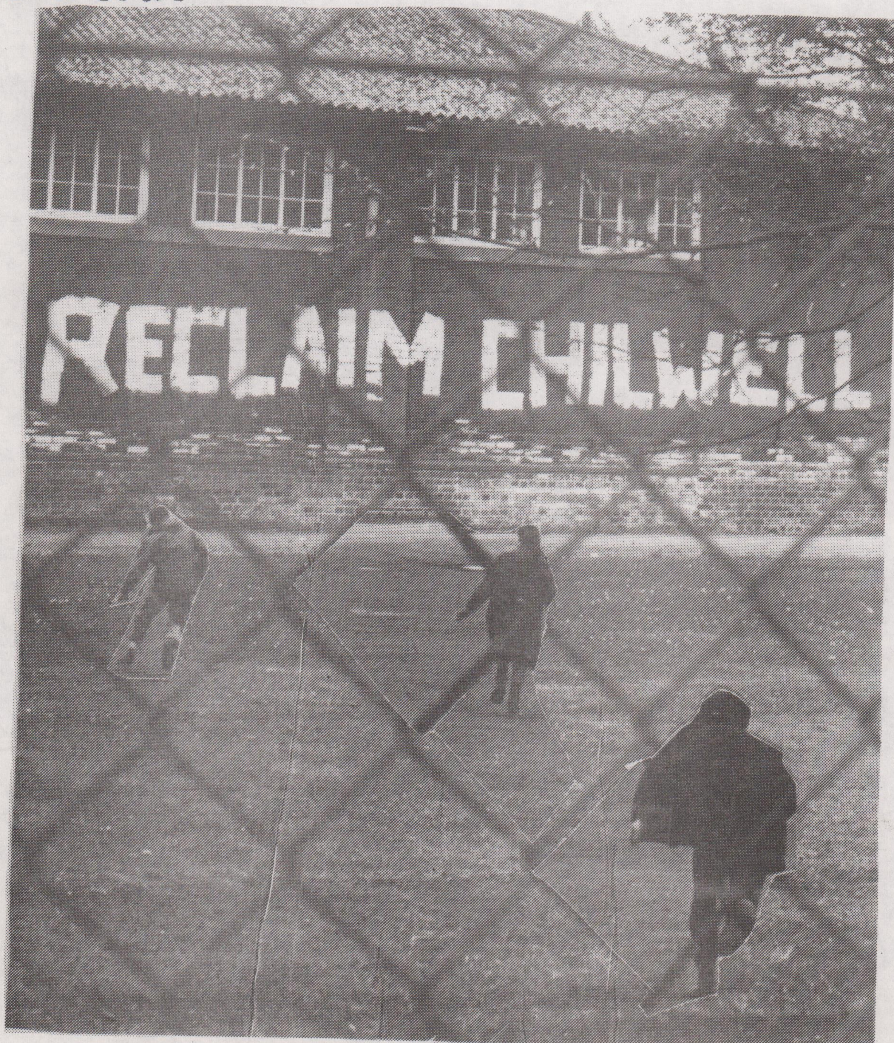
Mass Trespass at USAF Chilwell, July 1st. 1,500 protestors reclaimed the base.