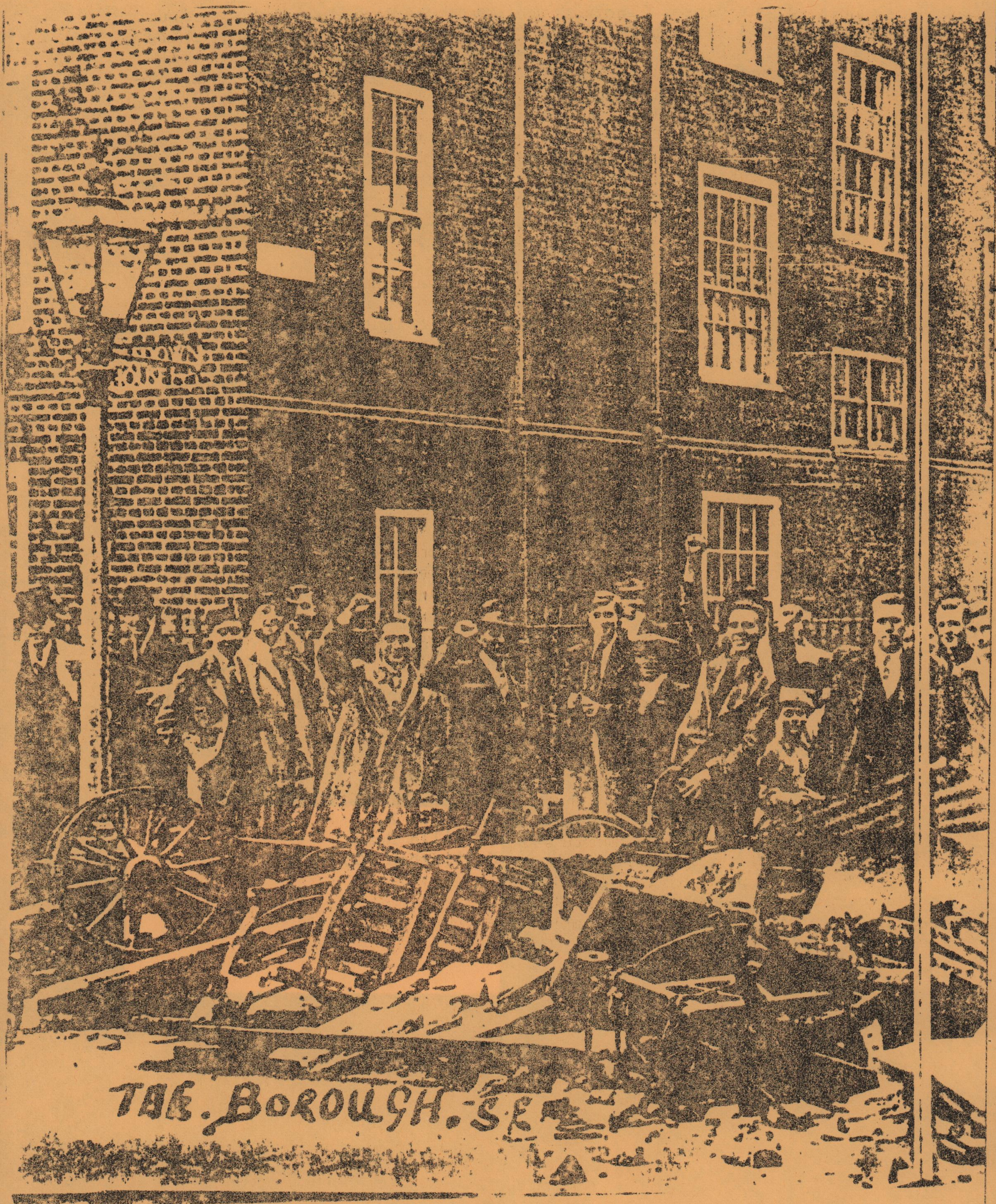
BARRICADES IN LONDON IN THE 1930s.