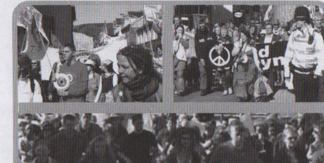
The first Welsh Social Forum was held over the recent Mayday bank holiday in Aberystwyth it ended with a Mayday march through the town.