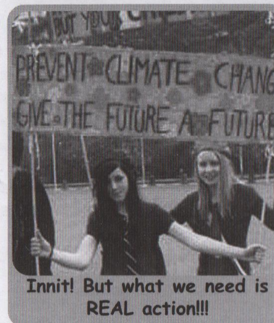
Innit! But what we need is REAL action!!!

less than 1% of profits on renewable energy. As the planet is getting hot & furious, so must the resistance! Action must be taken for finding alternative ways of living, & action must be taken against climate killers. A camp against climate change is happening in the North of England on 26th August to 4th September with the aim of bringing together people campaigning against the many industries that are at the root causes of climate change & people promoting practical, human-scale solutions. More info: www.climatecamp.org.uk