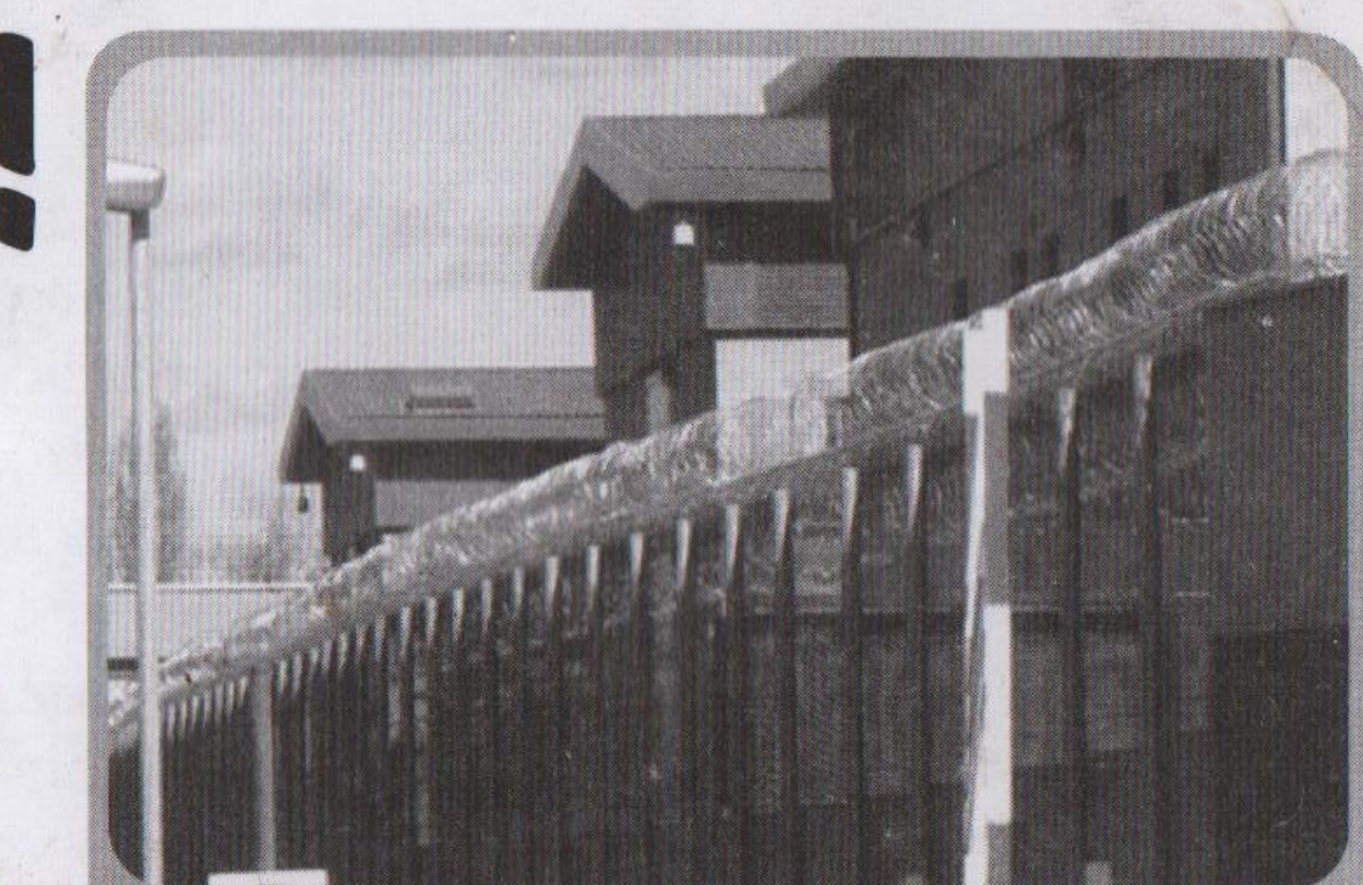
Colnbrook: Prison or 'centre'??

On April 15th over 120 inmates at Haslar detention centre, Portsmouth, began a