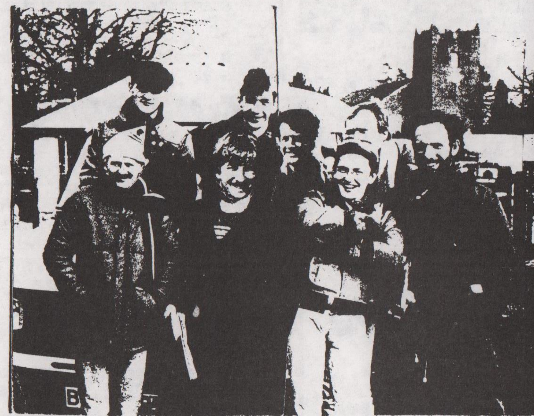
CO-OPERATORS HAVING A GOOD TIME!

"We left Nottingham in a snowstorm resembling an Everest expedition, complete with blankets, brandy, hot water bottles, and half a dozen hairdriers. We called in at Manchester to pick up several members and arrived at Ambleside around 11pm, at our converted schoolhouse by the