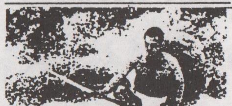
Ken Ogata posing as Mishima, the Samurai.

Yukio Mishima, actor, writer, film-maker and right-wing political extremist was an obsessive militarist narcissist whose work expressed a torrent of repressed homosexual emotions but whose philosophy glorified the manic homophobia of the Japanese military tradition of the samurai.