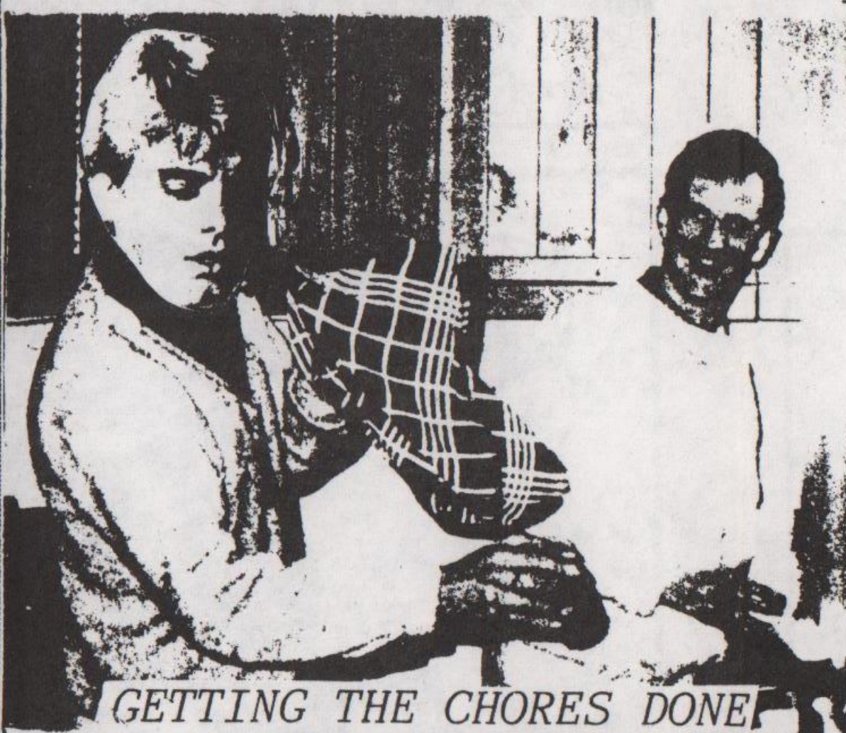
GETTING THE CHORES DONE

began packing up on Sunday afternoon for the journey home to Nottingham, all agreed the weekend had been great fun, and they were busily and enthusiastically preparing for the next jaunt in the Spring - a weekend in Wales. "...We could hire this castle I know of ..its got a balcony and divided between fifteen, say..." and so it went on. It was clear to me that the community spirit if not the centre had already arrived and was here to stay, and what's more I wouldn't be surprised if they end up with that castle! You can join the NOTTINGHAM GAY PEOPLES CENTRE CO-OP for as little as £2 and each person, whatever the size of their stake in the venture, has an equal say in its running. For further information write to: N.G.P.C.C., c/o Box 11, 118 Mansfield Road, Nottingham NG1 3HL.