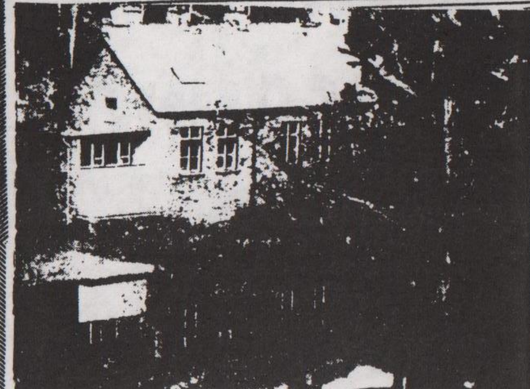
OUR "HOTEL" NEAR AMBLESIDE