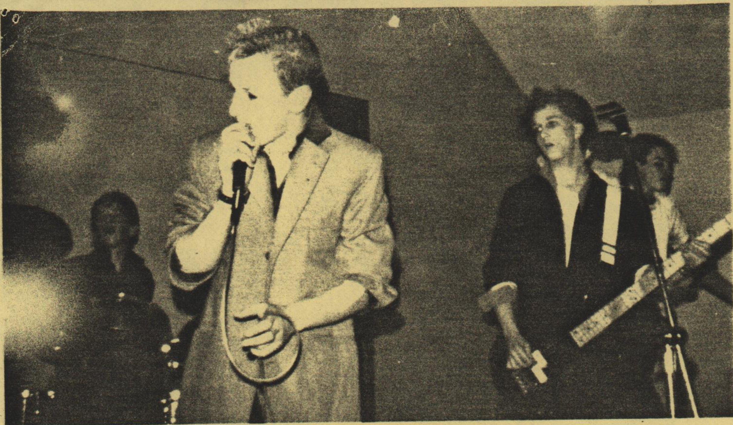
BAMBI IN SOHO - Fairmilehead Youth Centre - Gig reviewed by Kay Oss