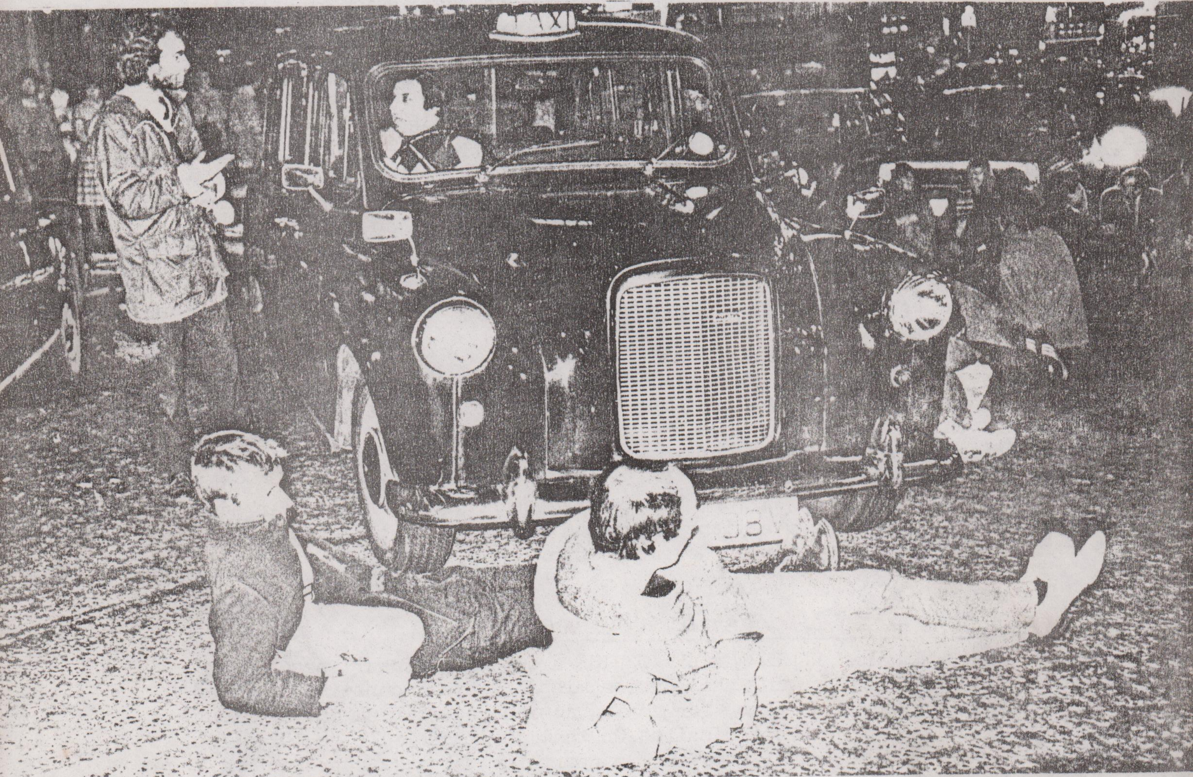
DIRECT ACTION, TRAFALGAR SQUARE, OCTOBER 31ST