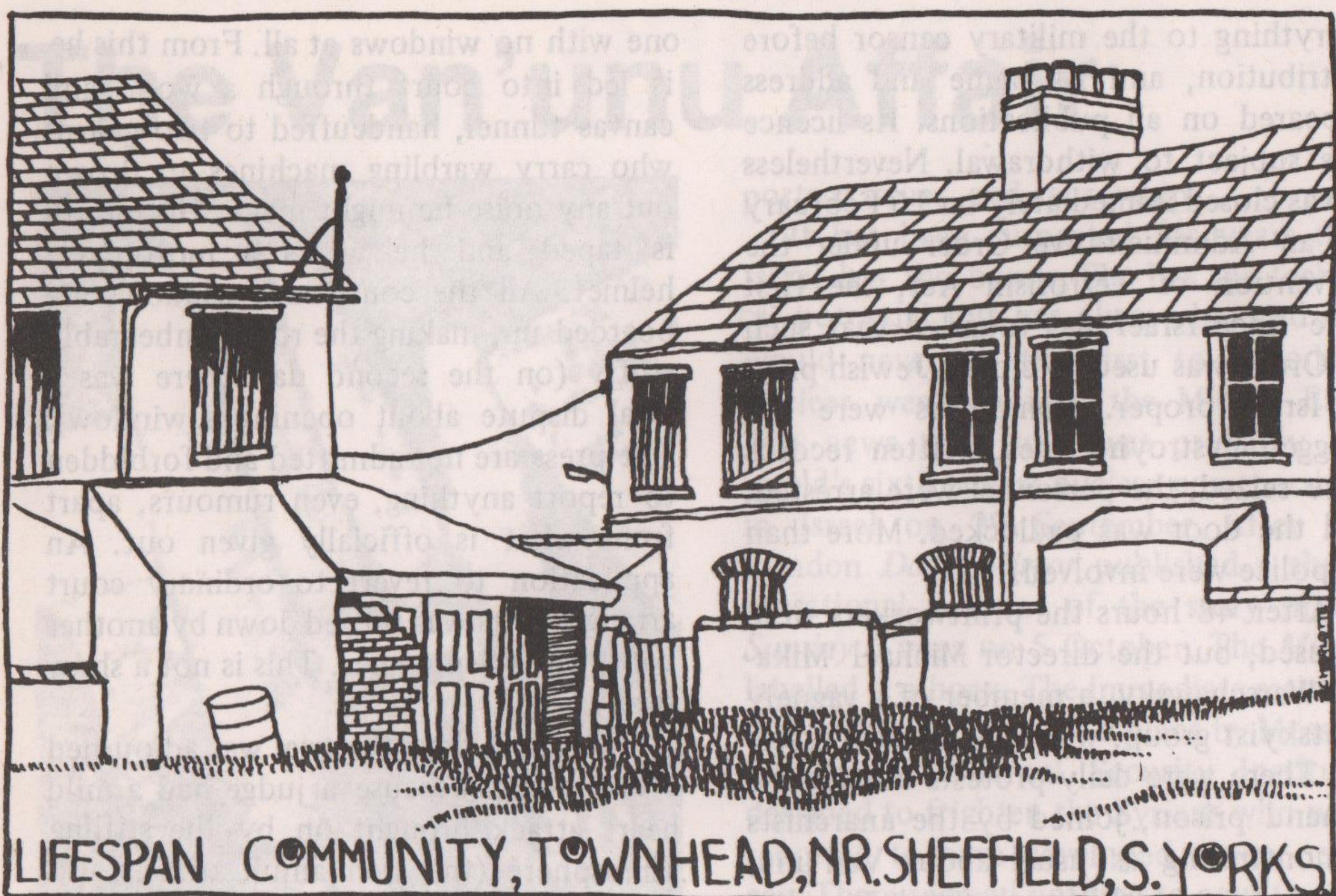
LIFESPAN COMMUNITY, TOWNHEAD, NR. SHEFFIELD, S. YOKS.

A COMMUNE I visited recently, called Lifespan, may be of interest to other anarchists.